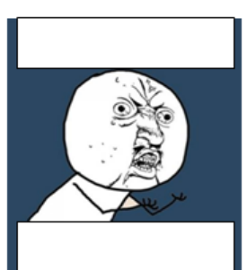
Y U No ...?