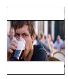
Lazy College Senior