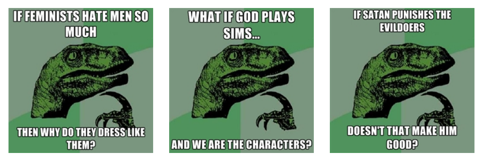
Figure 3. Sample 3: philosoraptor meme.

The meme called Philosoraptor below (Figure 3) wonders about all the questions in our lives that we should be asking. Unlike normal philosophers, Philosoraptor is a character who has the courage, the fortitude, and the insight to ask innocent questions such as "If a vegetarian eats vegetables, does a humanitarian eat humans?"