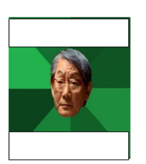
High Expectation Asian Father

Students Memes Writing Exercise Template: