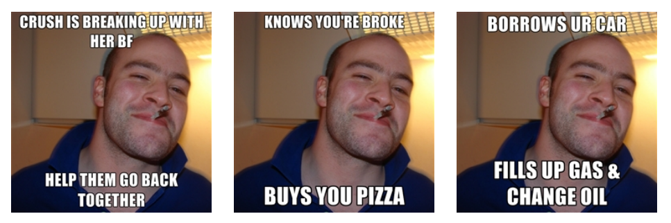
Figure 4. Sample 4: Good Guy Greg.

At first, he may seem irresponsible, but as soon as users are familiar with him, he's a hilariously helpful guy. The meme shows a photo of a man, smiling around a homemade cigarette. Viewers might see the meme smoking not only a homemade cigarette, but probably smoking a ganja (weed, joint, pot). Good Guy Greg is depicted as a really good guy, easygoing, kind, always keeps his cool. He may not be the smartest character, or may not get all the jokes, but he does nice things.