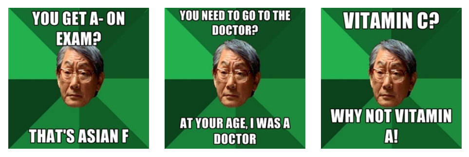
Figure 5. Sample 5: High Expectation Asian Father.

High Expectations Asian Father (Figure 5) plays a role as a stereotype of highly demanding, perfection-seeking Asian parent, as he pushes his children beyond the limits of endurance in matters of education and even overall performance.