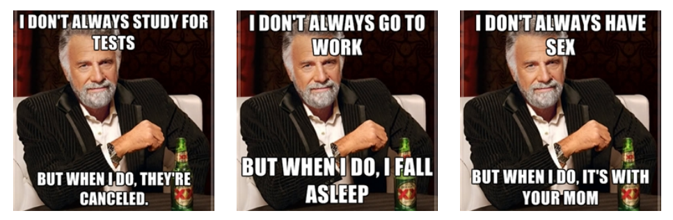
Figure 2. Sample 2: The Most Interesting Man in the World.

This meme is called as The Most Interesting Man in the World (Figure 2), which it all began when as a commercial of Dos Equis Beer. The company released a set of commercials with this character, with each one showing his extreme level of interestingness and charm. The ads were aired locally in 2006, and gained much more attention when they went national in 2009.