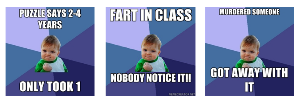
Figure 1. Sampe 1: Success Kid Meme.

Below is the first example of internet meme (Figure 1).