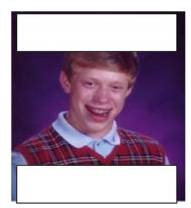
Bad Luck Brian