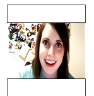
Overly Attached Girlfriend