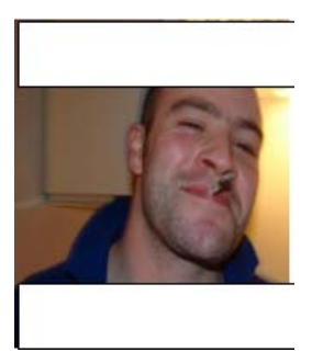
Good Guy Greg