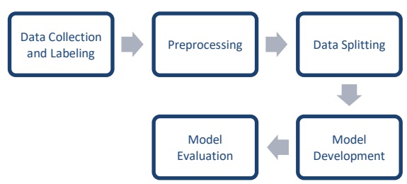
Fig 1. Research methodology

This research performed sentiment analysis on the League of Legends: Wild Rift game review data from Google Play Store by using the Naive Bayes Classifier (NBC) algorithm. The methodology of this research is shown in Figure 1. There are several stages in this research methodology starting from data collection to model evaluation. The explanation of each stage is provided in the following sub sections.