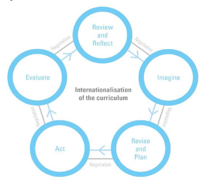
Figure 2: The Process of Internationalisation of Curriculum (Source: Leask, 2012) (Reproduced with the permission of Office for Learning and Teaching)

An internationalised curricula includes international and intercultural dimensions (Leask, 2009). This section provides some suggestions for allied health educators for internationalising their curricula. These suggestions are grounded in the preceding overview of internationalisation approaches in other disciplines and a summary of current internationalisation approaches in allied health. A list of key questions that needs to be considered by academic teams embarking on an Internationalisation of Curriculum process is described in detail in Leask (2012). Leask emphasises the need for these teams to engage in a cyclical process of conceptualising, planning, implementing, reflecting and evaluating programs and activities for internationalisation of curricula (see Figure 2). Leask also describes the important role of the institution as well as the discipline involved in the internationalisation of curricula. The institutional policies (for example, graduate attributes), international dimension in degrees offered (example, international languages offered as subjects within courses) and financial support for developing international teaching and