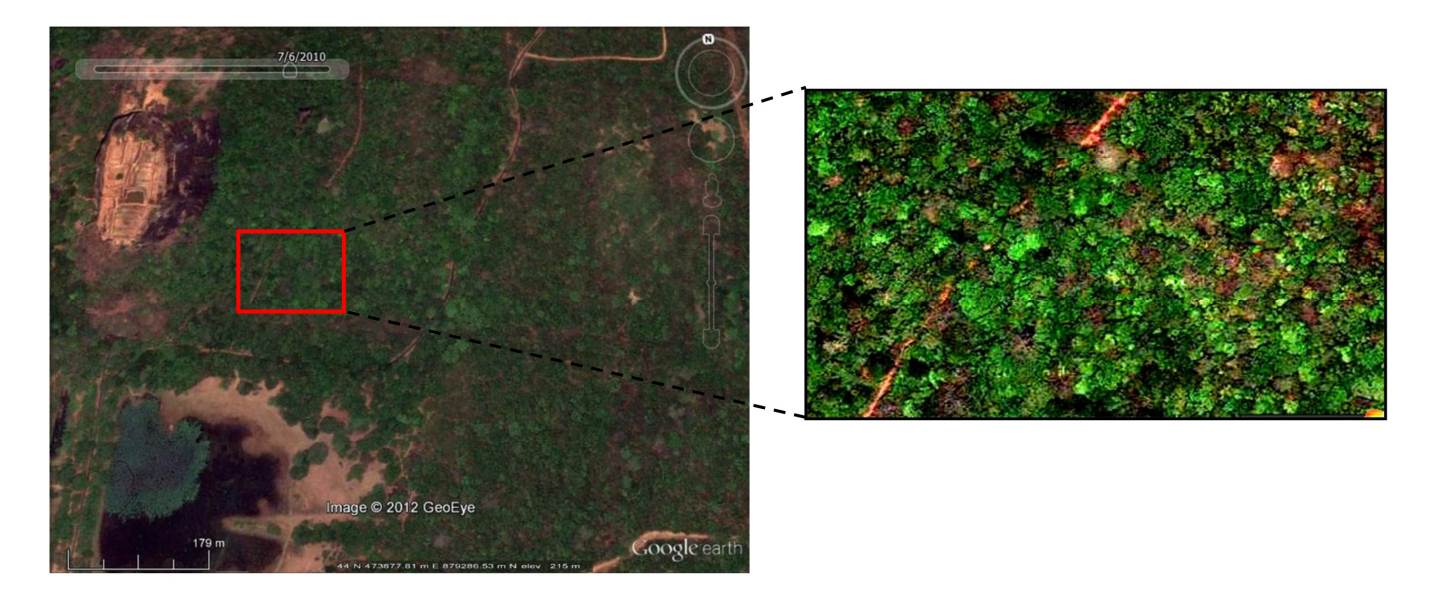
Figure 3: Canopy of the Sigiriya dry zone forest during the dry spell. Light green color patches on the canopy are the new flush. High spatial resolution images were acquired from Google Maps and Google Earth.

From the satellite data, it was observed that there was a leaf flush with canopy green-up in the dry zone forest (Figure 3). However, in the arboretum a leaf flush was not visible due to small size of the site. An unusual above ground leaf flush has also been observed in Amazon forests in an extreme drought (Berlin et al. , 2000; Saleska et al. , 2007). Pau et al. (2010) have also identified Hawaiian rainforest green-up in responses to seasonal and El Niño-driven droughts. Nutrients required to grow the canopy during the drought may also have been supplied from the soil labile C decomposition, as mentioned above.