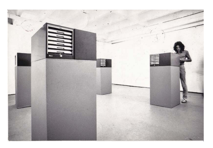
Figure 2: Art & Language group project at documenta 5 (1972), Kassel.

1991; LeWitt, 1969). The term "conceptual art" was first used by the Fluxus movement member Henry Flynt as a characterization of his performances in the essay published in An Anthology of Chance Operations in 1963. Conceptual projects show an increasing approximation to the idea as an artistic medium, at the expense of visual form. The tendency to demonstrate ideas instead of visual form is also evident in the titles of projects: for example, Joseph Kosuth's series Titled (Art as Idea as Idea) in 1966-1967, or a group exhibition organized in 1969 by art dealer Seth Siegelaub in New York called January 1-31: 0 Objects, 0 Painters, 0 Sculptors.