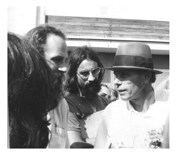
Figure 1: Joseph Beuys, 1973.

It is remarkable that conceptual curatorial projects that almost completely abandon the distinct visual component of an exhibition – for example, Voids: A Retrospective (2009) at the Centre Pompidou in Paris, curated by Gustav Metzger and Matthew Copeland, devoted to the interpretations of "nothing" in the exhibition practice –, are not able to abandon the textual aspect. At the exhibition at the Centre Pompidou there were completely