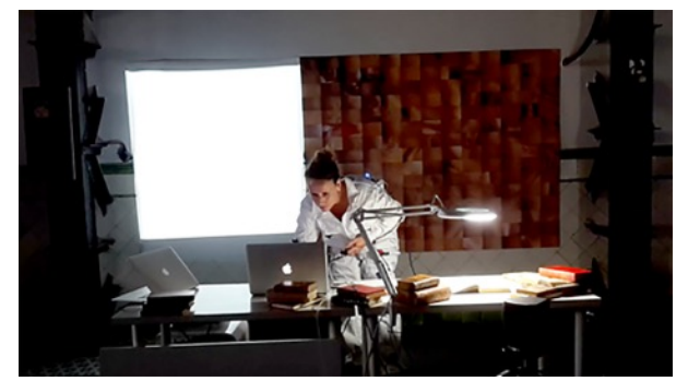
Figure 4 | Emerging Self Performance Festival FACTT Lisbon MATT. Source: the author, 2017

'membrane as liminal state of transience', as a metaphor for the exploration of what is natural or artificial, duration or memory. In contemporary life, claims Jens Hauser (2008), skin, membranes and tissues rest in a pervasive cultural position positioning as an instrument and metaphor across theory and praxis. Simultaneously skin is an organ that visibly shelves as memories the passage of time and the lived experiences, it is our interface with the outside world that contains our life but seen in detail is a biotype that houses fungi, bacteria, viruses and parasites. In the embryonic stage of our growth the neural tissue and the skin both result from the same tissue (ectoderm) and their binding allows expression of the emotions in the skin (Adler, 2017). When we become scared or ashamed, excited or angry, we feel pleasure or anguish, the temperature and humidity of the skin change because the sympathetic system, which belongs to the neurovegetative system, controls these functions. If in stressful situations, hormones such as adrenaline, noradrenaline and cortisol will cause changes in the skin, in a situation of love and stimulation by touching the hormone oxytocin leaves us with a feeling of happiness.