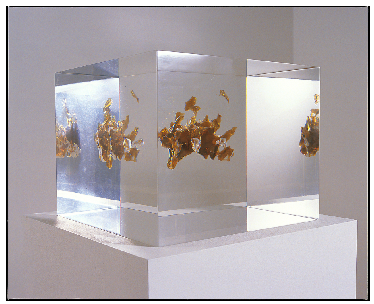
Figure 5 | Annie Cattrell, Sense-Seeing, 2002. Courtesy of the artist.

Scientific techniques of visualization of the innerhidden body are at the center of yet another work by Cattrell, the sculpture series Sense of 2002-2003 (Figure 5), in which the artist resorted to advanced technologies of neuroimaging to explore the physicality of consciousness. It is composed by five bright acrylic cubes wherein irregular translucent forms seem to float. These amber-colored shapes