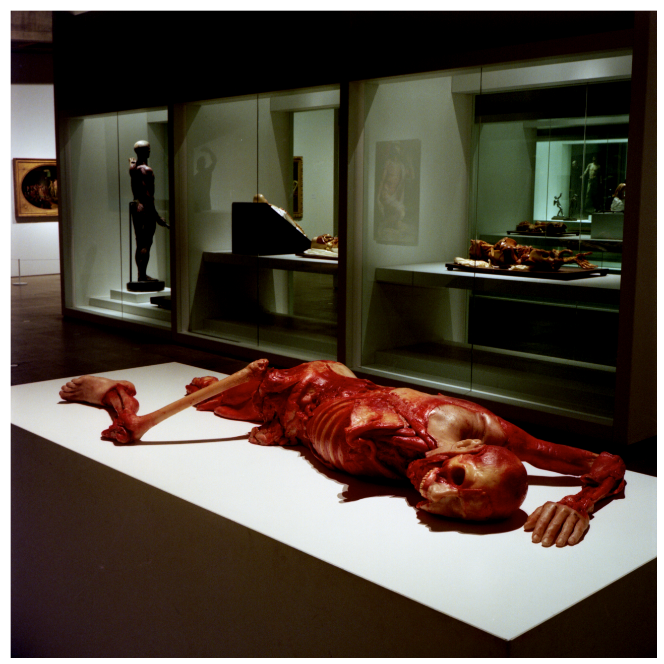
Figure 4 | John Isaacs, A Necessary Change of Heart, 1999.

sculpture, composed of parts cast from the body of the artist, so that he becomes simultaneously the dissector and the dissected, we see a cadaver is torn in pieces, with the left foot and both arms missing. The bleeding corpse is crouched on one side, with the skin completely removed to expose the viscera, except for that of the right foot, whose integrity renders the whole sculpture even more disturbing, because we recognize it as a part of the human body as we know it, the body intact and alive. This artwork is open to multiple interpretations. When it was shown for the first time, in Basel, it was presented as a metaphor of colonial conquests, with the naming of the body parts connected with the naming of