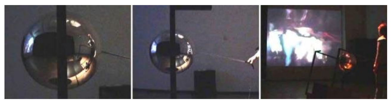
Figure 3 | Set up of the installation I/VOID/O by Sandro Canavezzi de Abreu.

The mergence of the gaps found in both between the systems in translation and between object and observer is materially and metaphorically expressed in the installation I/VOID/O (2002-2010), by Sandro Canavezzi de Abreu, in collaboration with Daniel Barreiro, who designed the soundscapes. This installation is the last and interactive version of an aesthetic investigation that started with the following imaginary situation: What could one see if located completely mirrored sphere? inside a The installation and the whole creative process is depicted and analysed by the artist in his doctoral thesis (Canavezzi, 2011), who built the mirrored sphere embedding inside four cameras: one is movable while fixed at the tip of a stick to be manipulated by participants; other two are linked to produce stereoscopic images, and a forth that is fixed in attempt to capture an objective observation of what happens inside the infinitely reflexive blackbox (Barreiro et al., 2009). A version of the installation's set up can be seen at Figure 3.