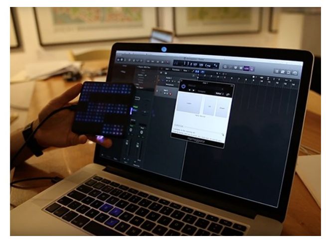
Figure 2 | a) The JUCE Machine Learning Hackathon and b) the winning 'hack' "Harmeggiator".

distributed along with a short pre-hack questionnaire about participants' skills in software development, programming languages and environments, and machine learning. Participants then had six hours to complete a "hack"—a small project of their choosing that used the JUCE RAPID-MIX Module-after which every team presented their hack to a jury panel of JUCE and RAPID-MIX representatives. Participants worked in groups of no more than three. Teams posted their hack code to GitHub. Hackathon facilitators recorded questions, critiques and feedback that were voiced by the participants. After the awarding ceremony, we conducted structured interviews with participants. We interviewed participants about changes in their design goals throughout the hack, module features that they used, limitations they discovered and strategies they used to overcome them, and suggestions for realworld applications of the module. The interviews were video recorded and subsequently analysed.