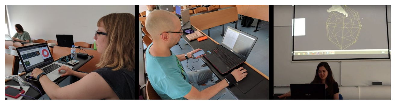
Figure 3 | a) and b) Participants working on their projects and c) presenting a final project.

piano. Technical and conceptual issues prevented the timely delivery of a fully functional hack.