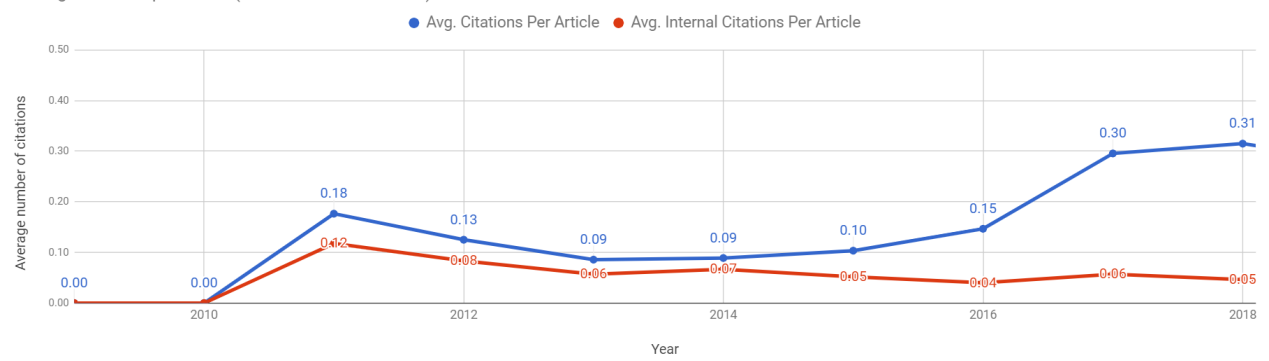
Chart 2 | Average citations per article.

Average citations per article (based on CrossRef data)