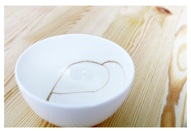
Figure 3 | Photo of "Chrysalis Gemini".

The project's subject is framed as the everyday use of ceramics in the form of archetypical hand-held bowls. These bowls are to be made of self-healing ceramics. Therefore, when one of the "Chrysalis Gemini" bowls is cracked deliberately or by accident, the embedded healing agent is exposed and the composite closes the crack. We imagine this agent as being designed to have the additional ability to absorb flavour and colour. In this way, the food and drink contained after the healing process leave traces in the ceramic. Consequently, breaking a bowl not only changes its