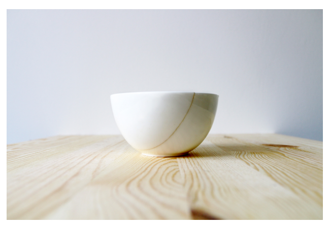
Figure 1 | Photo of "Chrysalis Gemini".

"Chrysalis Gemini" is first and foremost an interactive concept for ceramics with self-healing abilities. Technical concepts for ceramic components with selfhealing abilities are under development by material scientists and engineers (cf. Ponnambalam, 2012). These concepts focus on nanoscale fractures and are based on embedding microencapsulated healing agents within the structure of the ceramic which, when exposed by a crack or a rupture, starts to react and fill the gap. For the project proposed the laboratory work focused on mechanical endurance, this serves as a starting point to elaborate on a design scenario that engages with the future use of new enhanced materials.