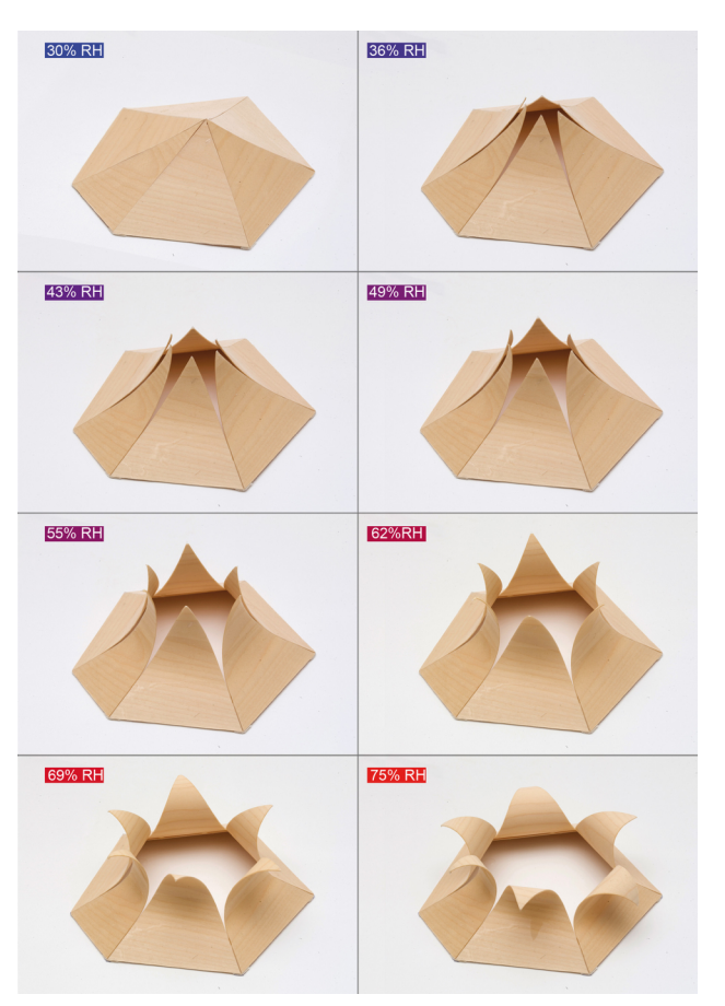
Figure 7 | HygroSkin-Meteorosensitive Pavilion / Achim Menges Architect + Oliver David Krieg + Steffen Reichert. Process-Responsive Component.

Applying the title "programmable" to the material environment and material-human relations, as has been done through the expression "programmable