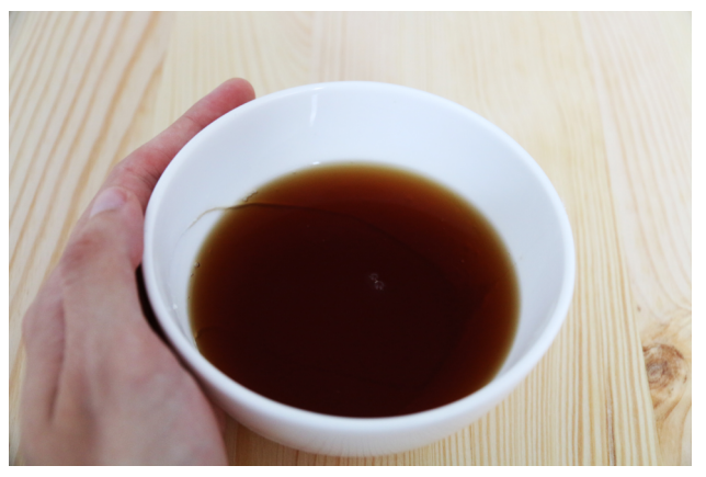
Figure 2 | Photo of "Chrysalis Gemini".