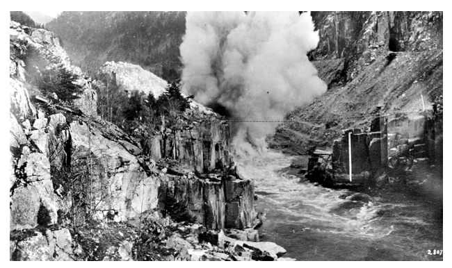
Figure 8 | Detail of historical image from the table, "Clearing Hell's Gate Rockslide, Fraser River ca. 1916,"

The slate blade and ice cube are two such belongings that match up to tell a larger story about their importance in fish preparation and preservation (see Figure 7). In the past the slate blade was used to process fish for drying, smoking, and cooking, while today fish are often preserved through freezing, in addition to traditional methods. The fragments of information that appear on the table when a visitor discovers this match tie the concepts of everyday fish preservation into the greater issue of fish conservation and sustainability. The quotes, images, and historical documents describe how overharvesting bv commercial interests and environmental changes have had a dramatic impact on the salmon, sturgeon, eulachon, shellfish, and other culturally significant species.