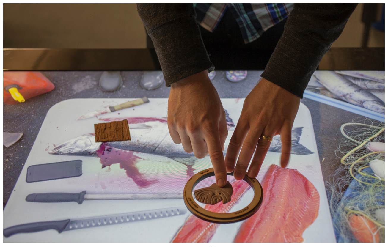
Figure 1 | Testing ring and belonging prototypes for ?elawik* - Belongings.

technology and culture both past and present. The Museum of Vancouver showcases ancient Musqueam belongings and ties them to the more modern histories of colonialism, heritage politics, and cultural resilience. The MOA exhibition, which includes the ?elewik<sup>w</sup> – Belongings tabletop, shares Musqueam values and worldview using media-rich installations and told from the point of view of named Musqueam community members' voices. The exhibition at MOA runs from January 2015 to January 2016.