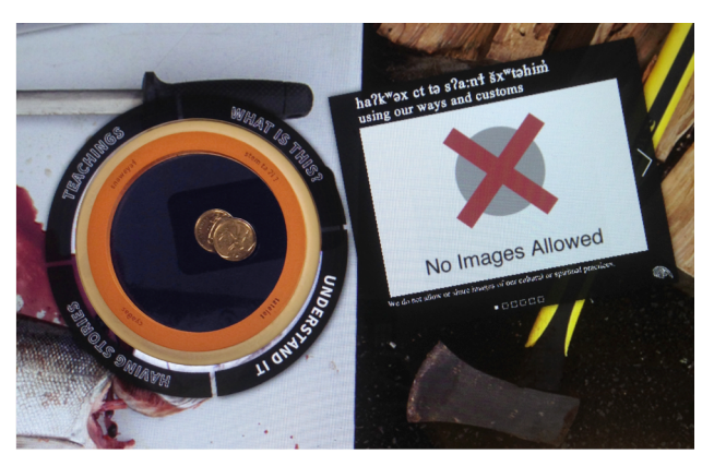
Figure 6 | The quarters connect to the iPhone.