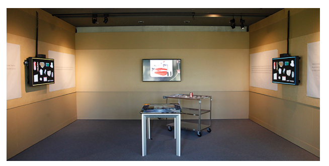
Figure 4 | The installation at the Museum of Anthropology.

Visitors can further explore the belongings by connecting an ancient belonging to its contemporary match to learn about the continuity of Musqueam culture from the past to present day, learning what has changed and what has remained. When visitors connect two seemingly unrelated belongings from the past and present day, again, a series of texts, contemporary images, historical documents, and quotes from community members appear on the table. Through this assemblage of information, visitors gain insight into the history of Musqueam culture and how their traditions remain part of their everyday life.