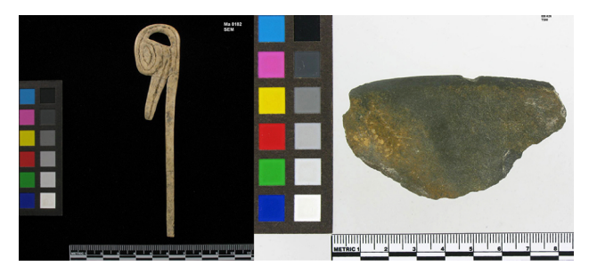
Figure 2 | Blanket pin and slate blade.

Vancouver. While a number of ornate, intact belongings were excavated, preserved, and disseminated through exhibits and publications - for example, a zoomorphic blanket pin - the vast majority of the belongings removed from cesna?em are fragments of stone or bone, and are often seen as less exotic or mysterious to a common viewer (see Figure 2). While these belongings may appear less significant than more aesthetically intriguing belongings, they represent complex histories, deep ancestral knowledge and are of continuing value for the contemporary Musqueam community. Additionally, these belongings, which in many ways represent technologies used for daily activities, speak to the wealth, resourcefulness, and detailed knowledge of the Musqueam ancestors at cesna?em.