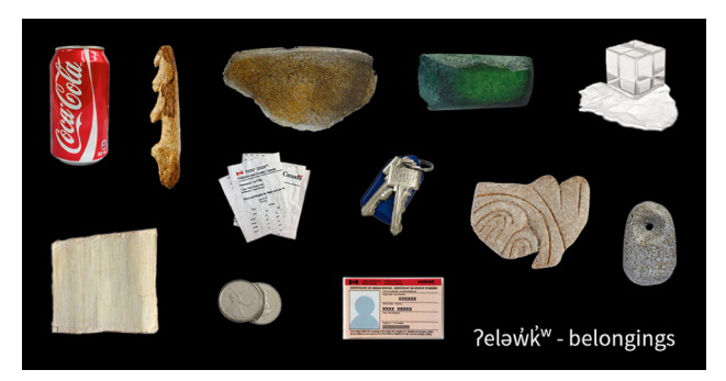
Figure 3 | The twelve contemporary and ancient belongings.

?eləwik <sup>w</sup> – Belongings is a tabletop application for the Samsung SUR40. The SUR40 is a horizontal HD display with legs. Using Microsoft PixelSense, which utilizes infrared sensors to detect objects on the