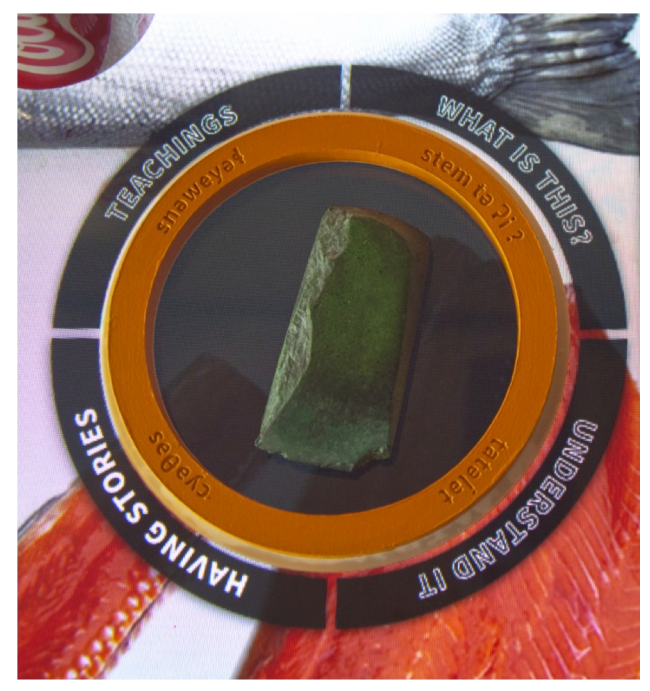
Figure 9 \mid Four categories appear in the digital ring.

an impact on daily life in the past and present as well as related issues affecting Musqueam life. This wealth of information helps visitors see the belongings as more than historical fragments.