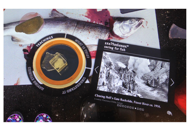
Figure 7 \mid The slate blade pairs with the ice cube.