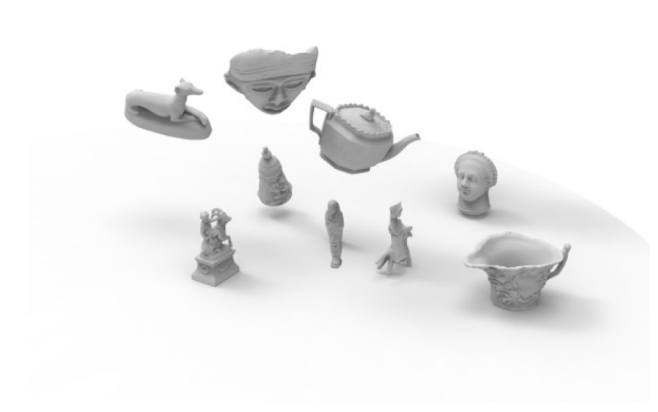
Figure 1 \mid Digitally rendered image of 3D scans of museum artefacts from the National Museum Cardiff.

Cardiff, during which the participants' screen based and 3D printed submissions were displayed with the original artefacts (Figure 2).