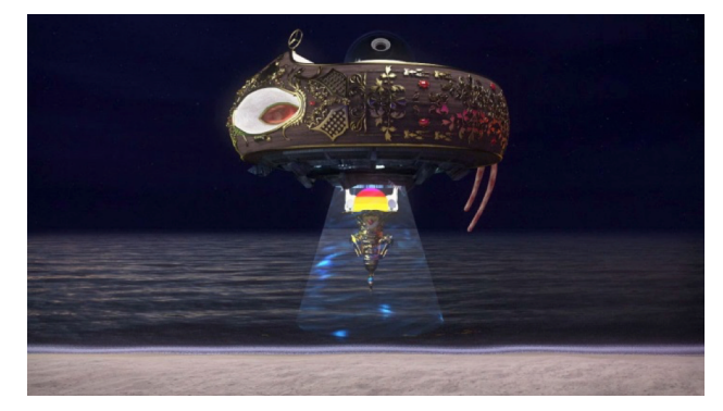
Figure 8 | Alien Fanfare, Jonathan Monaghan, still image from animation.