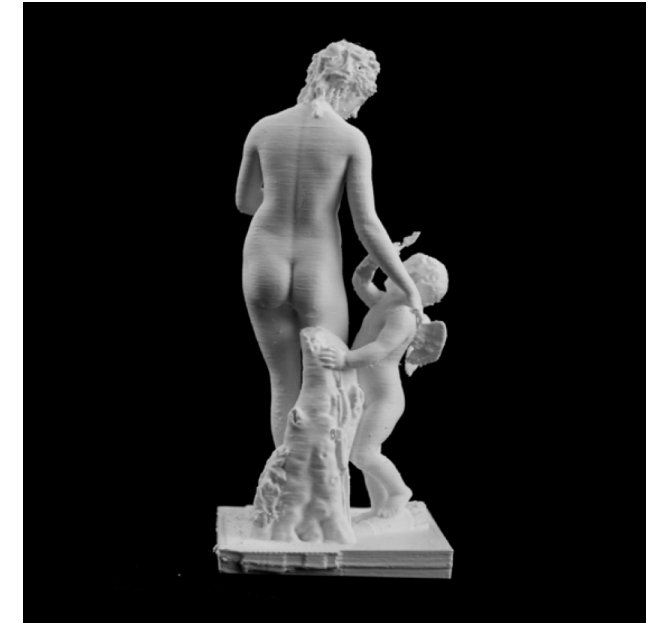
Figure 3 | 3D Print, ScanTheWorld, from the Lincoln 3D Scans online gallery.

The size and material of home 3D printing is often limited by the capacity of tabletop 3D printers. Most commonly, privately manufactured 3D prints take the form of miniatures executed in plastic (Figure 3). These 3D printed miniatures resemble souvenirs. While most souvenirs are bought during a tourist visit, the digital 3D models can be downloaded from the Internet. They are accessible anywhere at anytime and are no longer necessarily connected to the experience of visiting a place or seeing an original object. They are souvenirs of visits not experienced but substituted through surrogate engagement with the digital reproductions. In one sense they offer nothing but