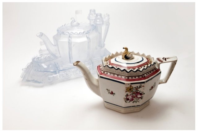
Figure 6 | Teapot Trainfortress, Ian Cooke Tapia, 3D printed model and original artefact from the National Museum Cardiff.

As well as paying reference to memories from the