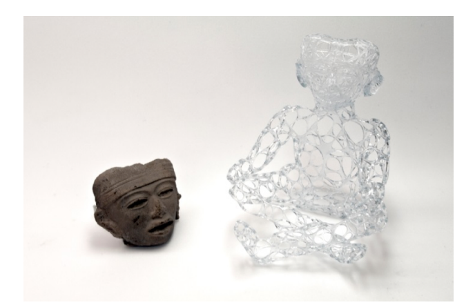
Figure 5 | Cantli, Mario Padilla, 3D printed model and original artefact from the National Museum Cardiff.

Panama-born artist Ian Cooke Tapia chose to work with the 3D model of a teapot from the National Museum Cardiff, which he turned into a steam-engine toy train (Figure 6). The architectural ridge around the top of the teapot reminded Tapia of the architecture or towers and castles. By building structures around the teapot model, adding cannons, wheels, and towers Tapia turned the teapot into a fortified castle on wheels, reminiscent of the toys he would construct as a boy; "It was almost like a flashback; as a kid I would always take old items or kitchen utensils, and make them into toys." As well as paying reverence to childhood memories, Tapia's piece also draws from his lived everyday experience; he drew a connection between his teapot train and the fact that he lived "next to train tracks" at the time of its creation.