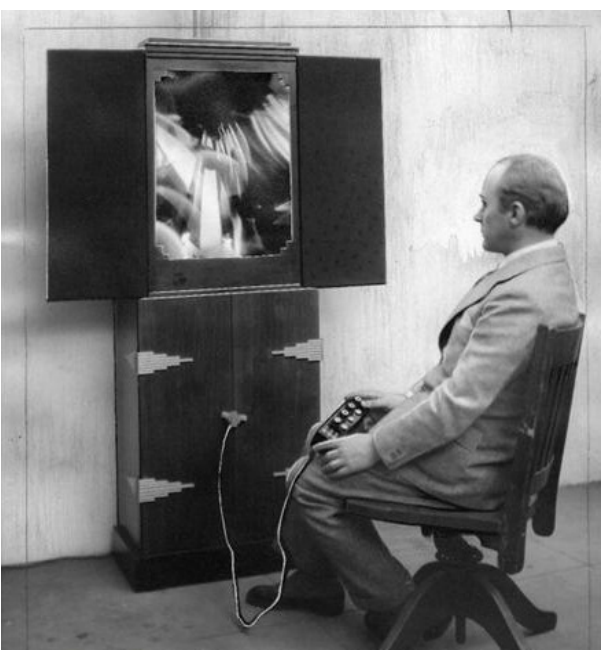
FIGURE 2 | The home version of the Clavilux.

Wilfred named this art form as "Lumia", the art of Light, the eighth art form. "Lumia" was an aesthetic concept, "the use of light as an independent art medium treatment of form, colour and motion in a dark space with the object of conveying an aesthetic experience to a spectator" (Wilfred, 1947, p. 252).