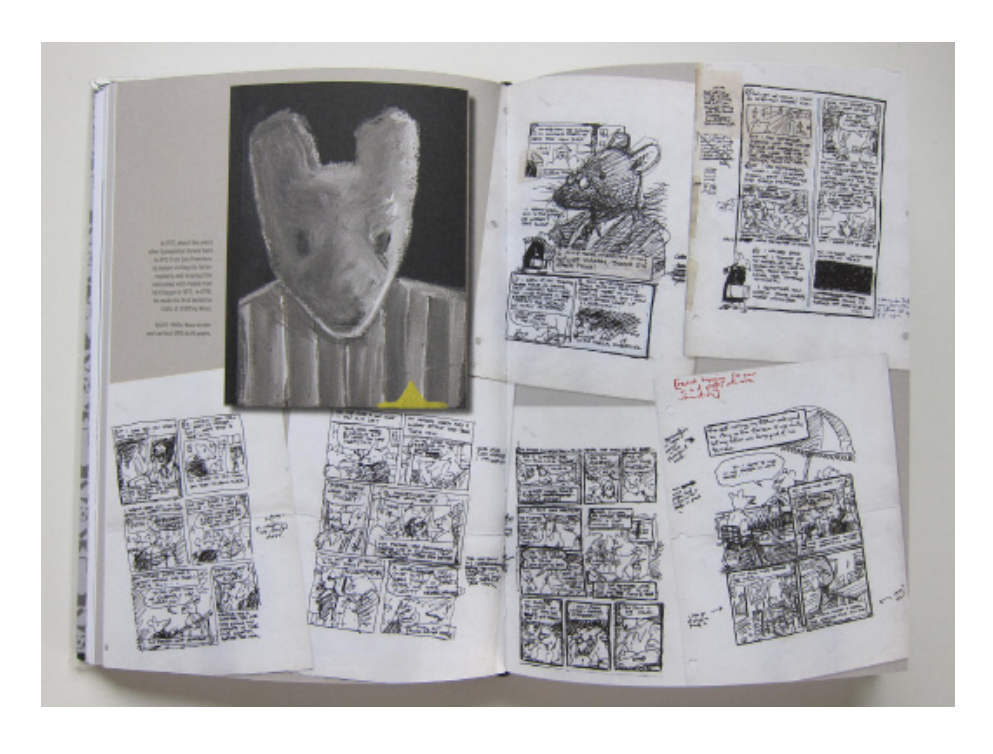
FIGURE 2 | Pages in Meta Maus - A Look Inside a Modern Classic by Art Spiegelman.

The written part of Meta Maus includes several subsections, and is mostly based on taped interviews with Art Spiegelman conducted by