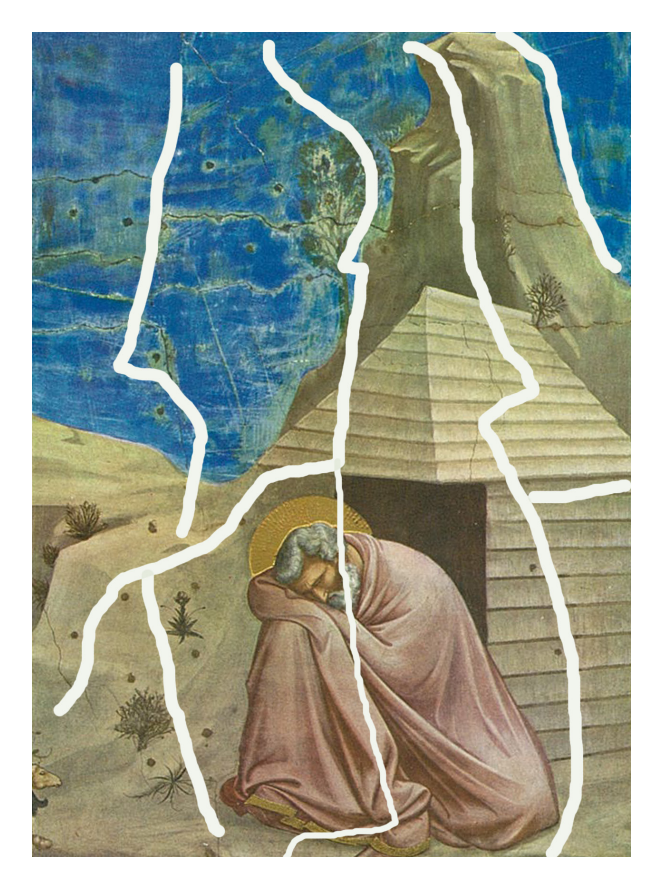
FIGURE 5 | 'Joachim's dream' (detail) by Giotto, 1305-6.