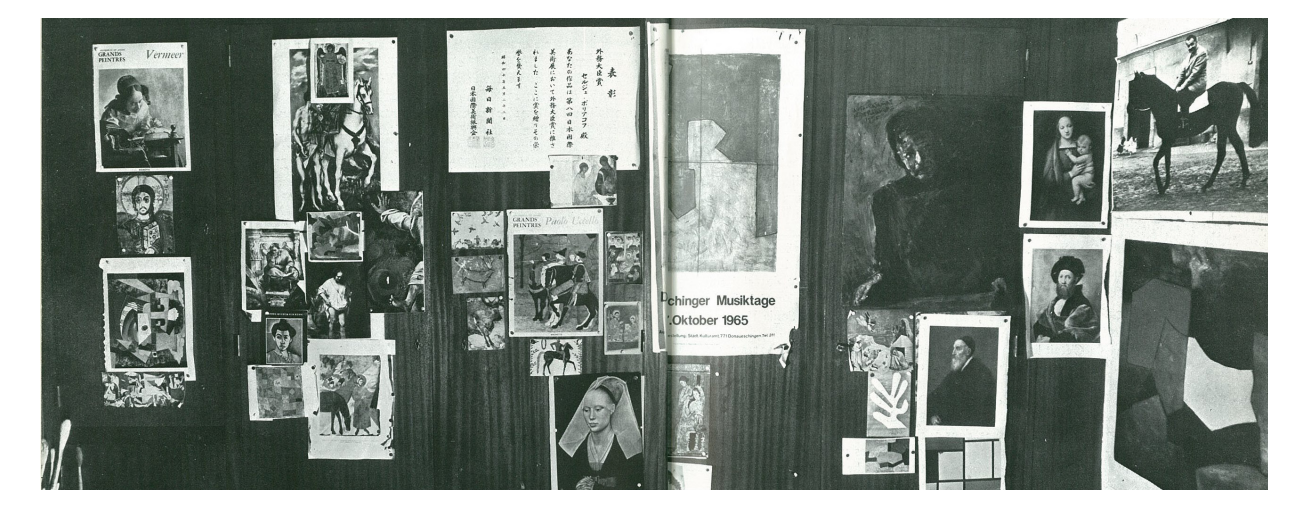
FIGURE 4 | The Mnemosyne on the wall of Poliakoff's apartment.

What Meyer Schapiro presents as 'style' ('the manifestation of culture as a whole'), is observable in the works of Poliakoff where is posited the total memory of culture as well as the contemporary view on culture. In his Mnemosyne , Poliakoff placed images of such different times which went from prehistory to Matisse's collages and saw in abstract art, justly, an effective means of abridging art history and to integrate it in his painting, updating it in this way: '(...) properly recognizing his debts towards his sources,