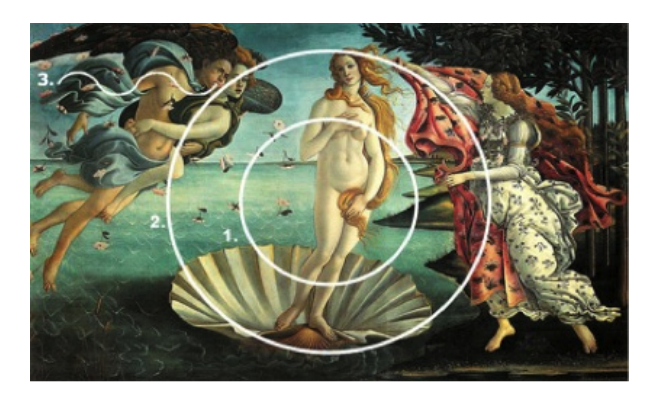
FIGURE 2 | 'Content and Form': 1 - Form; 2 - Content; 3 - Mnemonic wave.

not thinkable, to Warburg, in terms of aesthetical choice nor of neutral reception: it was more of a mortal or vital confrontation, according to the case, with the terrible energies those images contained in themselves and which had in themselves the possibility of making man return to sterile submissive ness or guide him on the path to regeneration and knowledge. This was true not only to artists (...), but also to the historian and to the wise'. These should, then, absorb the undulatory movement of 'transmission and survival' ( transmission et survie ) [4].