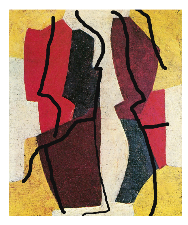
FIGURE 6 | 'Composition 1969' by Poliakoff.

towards the past, Poliakoff was formed in an era fertile in teachings to a man which aimed at broadening his culture, but which continued, without dispersion, researches started by Kandinsky and the Delaunays' (Marchiori, 1976, p.18). Poliakoff recognized the event of modern art as a privileged vehicle of expression of his own time. And in it he saw the possibility of integrating art history. The 'iconology of the interval' was, for Poliakoff, the direct observation of a tem poral interval between two different images: one, the ancient 'influence', the other, its new abstract interpretation.