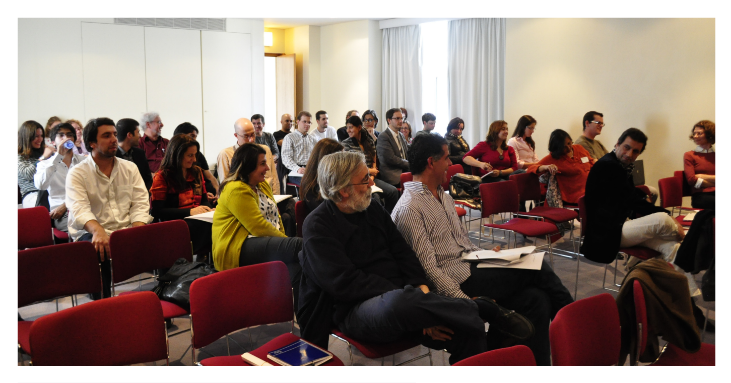
Public at the 2nd International Musical Itineraries Forum, room perspective.

The third and forth sessions of the first day, were dedicated to Sound, gesture, new technologies. In this session Steve Gibson (Northumbria Univ.) gave a presentation, with the title "Advanced media control through drawing: using a graphic table to control complex audio and video data in a live context", a demonstration of his Wacom tablet MIDI user interface. An application that enables user's drawing actions on a graphics tablet, to control audio and video parameters in real-time. Gibson defended that the use of a dynamic and physical real-time media interface re-inserts body actions into live media performances in a compelling manner.