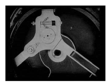
Ruttmann_Berlin (1 photogram)

But as the train in Ruttmann's film approaches Berlin (city), the two films diverge. Who is the protagonist of Ruttmann's film? The machine. In Berlin , the human element is just another piece of the mechanical ballet , of the coupling of the modernist city-machine with the machines that inhabit it. The "mechanisation of the world" is the central theme of the film. And the machines are the object of the close-ups.