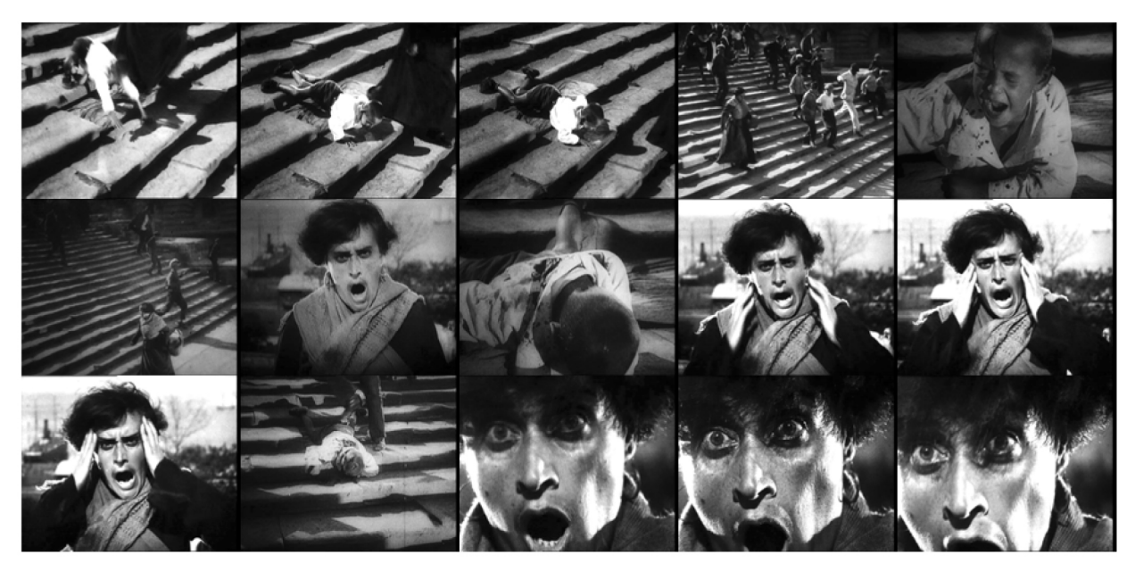
Sequência das escadas de Odessa, Potemkin, 1925

Watching Douro, Working River is like a journey to places visited before, recognisable, but at the same time surprisingly different. It is easy to confirm this impression when we see the so-called "accident sequence" in Douro (and difficult not to think again of the scene of the Odessa steps). Suddenly , routine and the movements of work are interrupted.