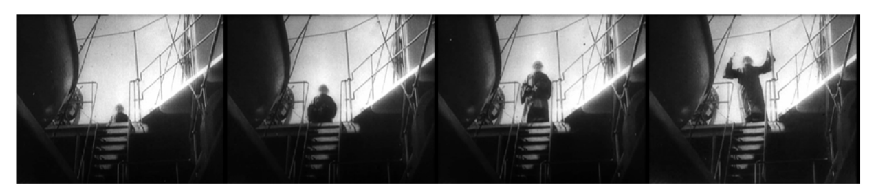
Nosferatu, 1922 Potemkin, 1925