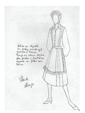
Figure 2: Ofélia and Arminda

be forgotten either that this is a working tool that is absolutely essential for the filmic construction. In this particular case, the planning should be noted, not just the script, because the final plan has all the basic elements, and is the most detailed, not only dramatically but also technically. The story-board, the organisation of the sets, the technical script, all contributed equally to make this project viable in a