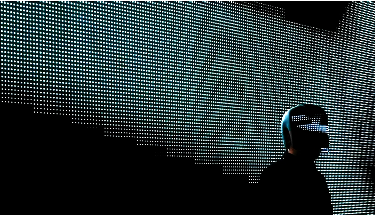
FIGURE 4 | Squarepusher Live Audiovisual performance (2012).

Nowadays, with the advances of technology, computation and interfaces, sound and image can be easily manipulated in real time. Every parameter of each medium can now be converted into data, without being affected by signal loss, and then used as an input in the other medium. Every aspect of sound (pitch, volume, timbre, duration) can be mapped and used as an input into the image generation system. All this data can now be used in generative systems that under certain rules created by the artist, would take the received data, process it, and output infinite and different results.