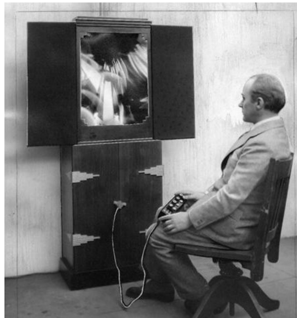
FIGURE 2 | The home version of the Clavilux.

Wilfred named this art form as “Lumia”, the art of Light, the eighth art form. “Lumia” was an aesthetic concept, “the use of light as an independent art medium treatment of form, colour and motion in a dark space with the object of conveying an aesthetic experience to a spectator” (Wilfred, 1947, p. 252).