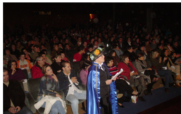
6 | Fig. 6: The author presenting the Intercultural Music Festival.

The Intercultural Music Education (EMI) of our children and young people results from the confluence and the environment posed by a proper and holistic arts education (EE), on a path of progressive deepening of Musical Training (FM) and also the openness to diversity through Intercultural Education (IE). We choose the variables Relevance (R) as a factor in choice of skills, learning objectives and the content and the participation of (P) as a factor for membership, voluntary and free for children and young people as indicators of quality of an Intercultural Music Education (EMI). Both variables must witness the fruitful meeting with the know-how and know-be ex-