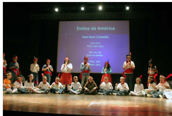
7 | Fig. 7: 4th and 6th graders playing together the Canadian Indian song Hani Kuni.