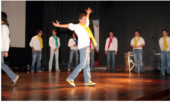
9 | Fig. 9: 9th graders expressiveness and creativity.