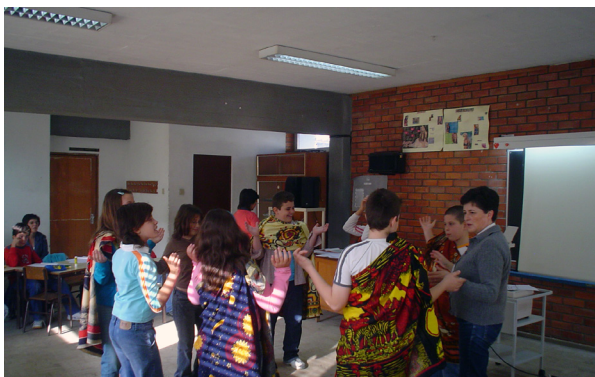
2 | Fig. 2: 6th Grade classroom - African Music, Culture and Traditions.

Summoned to the meeting of musical educators, Canadian researcher Renald Legendre arrived, bringing with him his model of PEDAGOGICAL RELA-