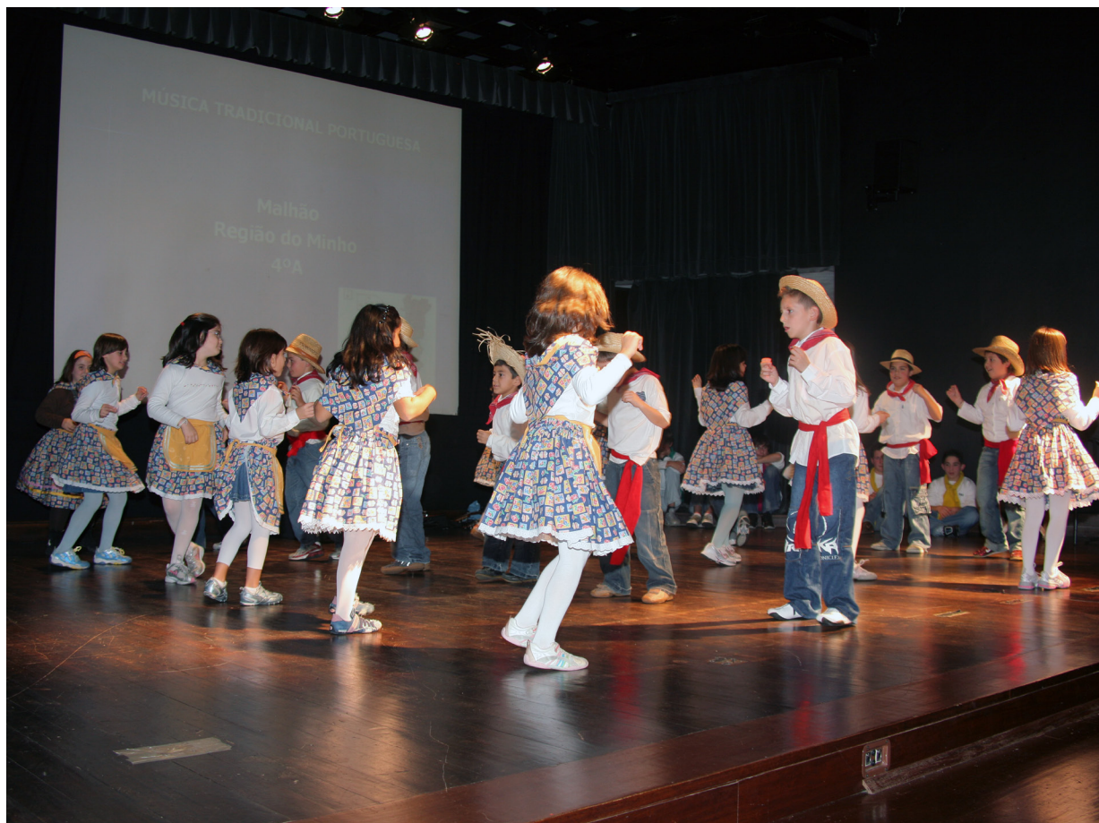
8 | Fig. 8: 4th graders dancing a traditional Portuguese theme.

Music is art and beauty It is an universal language Let us sing fraternity In this intercultural song