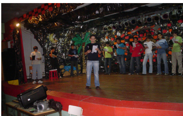
4 | Fig. 4: 9th graders practicing the dramaturgical-musical theatrical script.

TIONSHIP. Patiently he explained the complexity of all its components. He lingered in describing its main poles: the SUBJECT, the AGENT, the OBJECT and the ENVIRONMENT. He then denoted the existent biunivocal relationships: TEACHING RELATIONSHIP, LEARNING RELATIONSHIP and DIDAC-