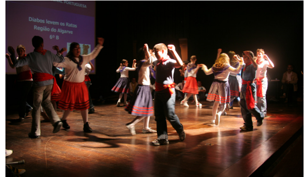
10 | Fig. 10: 6th graders dancing country music.