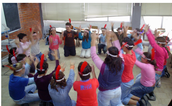
3 | Fig. 3: 4th graders learning a popular Canadian Indian song.