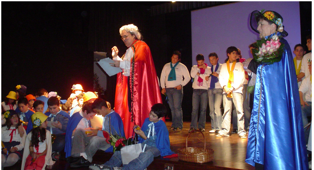
11 | Fig. 11: Mozart reads and assigns the doctoral degree to the author, written by students and teachers participating!...Very interesting and unprecedented times.