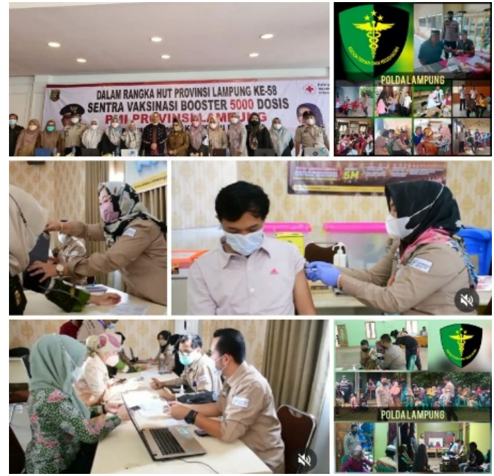
Figure 1. Implementation of the Third Dose of Covid-19 Vaccination in Lampung Province

In accelerating the implementation of the Covid-19 vaccination program, the Lampung Provincial Health Office is working together and coordinating with various parties including the TNI, POLRI, and Forkopimda. The process of implementing vaccination in Lampung Province is carried out by disseminating information regarding the time, place, and type of vaccine used.