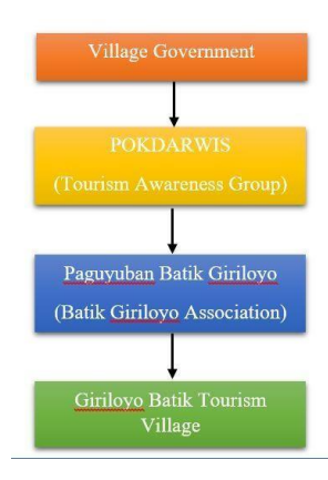
Fig. 5. The Hierarchy of Organization in Giriloyo Batik Tourism Village