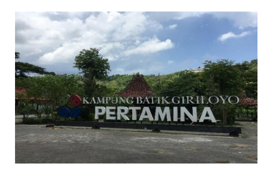
Fig. 7. The Main Gazebo Batik

Gazebo Batik is the place where most of the tourism activities are taken place. Despite the artisans can sell their products in the showroom (at the Gazebo complex), the Association allows artisans (accommodated bt their group) to display, sell and promote their products through their shops or workshop.