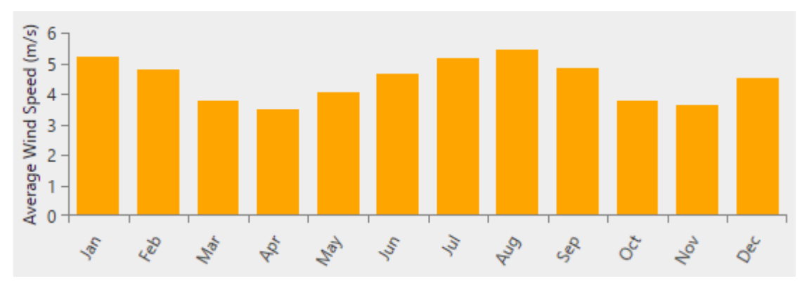
Figure 3. Wind speed data in the Southeast Sumatra Block area