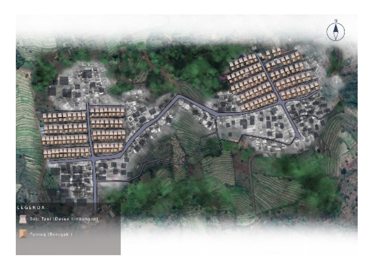
Figure 1. Description of Research Locations in West Limbungan and East Limbungan

The boundaries of Dusun Limbungan are as follows: south of Mount Rinjani, North: residents' settlements (Desa Perigi), East: West Limbungan, West: East Limbungan.