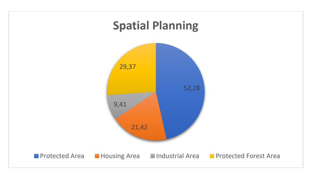
Figure 1 Balikpapan City Spatial Planning Based on RTRW 2012–2032

At the implementation level, the smart city concept requires communication technology systems in daily governance. However, the success of the smart city program is not only analyzed based on the use of communication technology alone. There are three challenges in implementing the smart city concept: technology, human resources, and the government. Therefore, a collaborative climate must be created to face these challenges (Sanjaya et al., 2018).