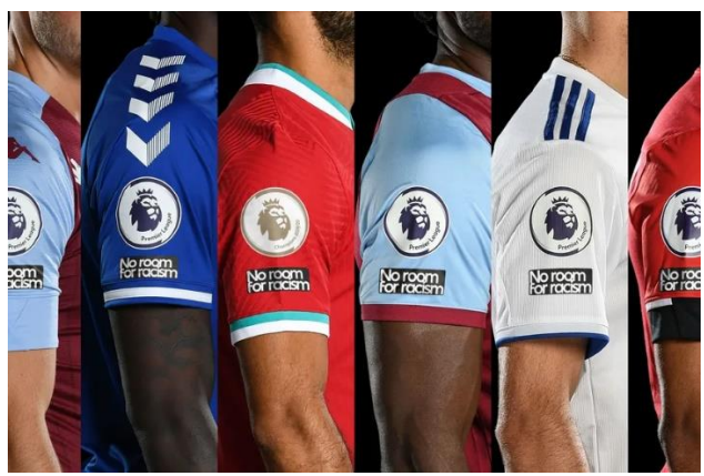
Picture 5: "No Room for Racism" campaign