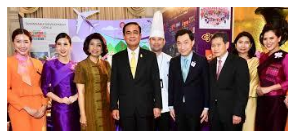
Figure 1. General Prayut Chan-o-Cha, Prime Minister of Thailand, together with H.E. Dato Lim Jock Hoi, Secretary-General of ASEAN, visited the Thai Airways International Public Company Limited (THAI) exhibition booth at the Thailand Together event for the ASEAN Chairmanship 2019.

https://www.thaiairways.com/en_TH/news/news_announcement/news_detail/Asean_Su mmits_2019.page_Copyright 2011 by Thai Airways.)