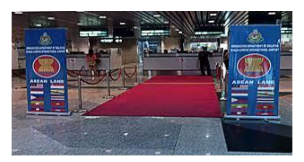
Figure 3. A view of the ASEAN Lane at the Kuala Lumpur International Airport.

Furthermore, the design of the airport could serve the needs of regional branding, or, projecting the region's identity. It is, for instance, the case of the ASEAN lane in international airports in Southeast Asia. This mechanism would incentivize ASEAN citizens to notice the ASEAN emblem, internalize their ASEAN identity, and take advantage of the assigned fast-track lane. ASEAN lane in international airports – a strategic measure under APSC Blueprint 2025 to promote ASEAN awareness - existed first in Thailand in 1995, followed by Malaysia, Viet Nam, the Philippines, Indonesia, and Myanmar (Thu, 2017).