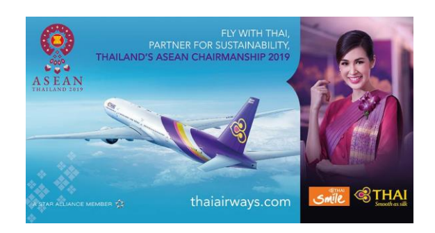
Figure 1. ASEAN Summits 2019.

Girl. She is the leading figure in the international marketing and advertising campaign of Singapore Airlines. In 1993, the Singapore Girl's wax model became the only commercial figure installed at Madame Tussaud in London alongside the world leaders and personalities (Heracleous et al., 2006). Another national flag carrier, Thai Airways, also provided example how civil aviation projects country image through marketing campaign and by hosting events during Thailand's ASEAN Chairmanship in 2019. A low cost carrier, AirAsia, also provided collaboration with ASEAN by launching "I Love ASEAN" and "Sustainable ASEAN" liveries to celebrate ASEAN 50th and 52nd Anniversaries in Manila and Bangkok (Paul, 2019), adopted "Truly ASEAN" as its first tagline in 2008 and continue to tailor its brand identity by adding the ASEAN emblem in its aircraft since 2017 (Kositchotethana, 2017), and launched the "Think ASEAN, Think AirAsia" campaign via social media and in-flight magazine (Mirtha, 2017).