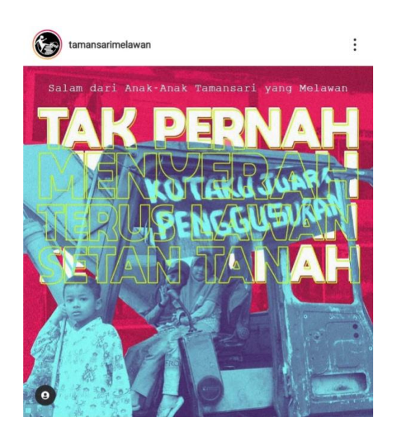
Picture 2. Diagnostic Frame on Tamansari Melawan Uploaded Content on Instagram

In addition to the discovery of uploads containing the condition of Tamansari residents being hit by injustice by the Bandung city government, prognostic frames are found in various uploads containing Tamansari's condition not being in good condition and several things that became the objection point of RW 11 Tamansari Bandung residents to the Bandung city government. Content uploads to the @tamansarimelawan account also demand accountability where the Tamansari Melawan Community has filed demands that the Bandung City Government must meet regarding the eviction phenomenon of RW 11 Tamansari including the following: