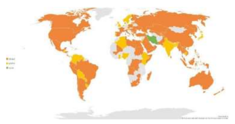
FIGURE 4. MAPS OF INTERNATIONAL BORDER CLOSURES IN APRIL 2020