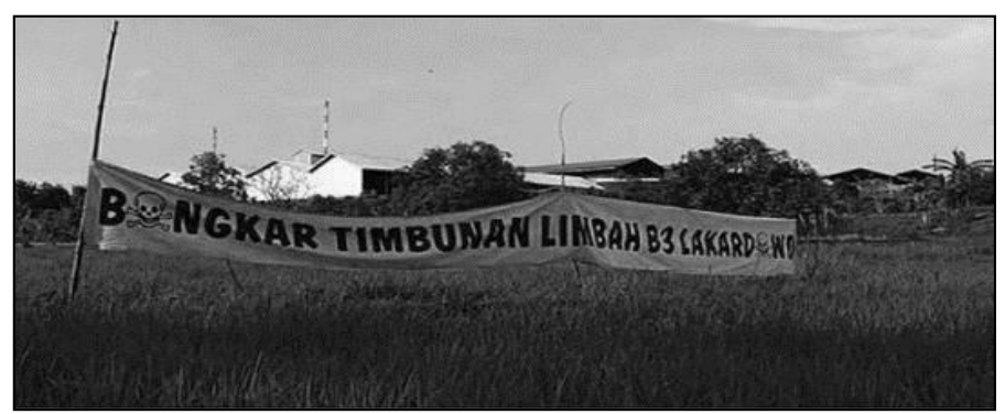
Figure 3. Pendowo Bangkit Campaign

Various methods have been taken so that the problem of hazardous and toxic waste in Lakardowo Village can be immediately completed and freed from the threat of hazardous and toxic waste because since the last four years the residents of Lakardowo Village have been harmed by the hazardous and toxic waste processing plant activities. Because of this issue, some children in the village have dermatitis due to the use of well water polluted by waste. Meanwhile, the company refused to process the identification of environmental pollution. Indeed, the use of campaigns in social, printed, and electronic media is also used by Pendowo Bangkit. It is aimed at creating an injustice frame felt by the community of Lakardowo Village from the environemental permit of the hazardous and toxic waste company. As for the documentation from the campaign carried out by Pendowo Bangkit to form joint awareness of the villagers about the dangers of hazardous and toxic waste in Lakardowo is as follows. (Figure 3)