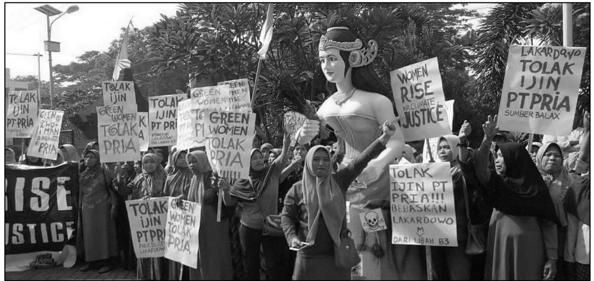
Figure 4. Mobilization of Lakardowo Village

The use of mass mobilization to conduct demonstrations is widely used by several parties or groups that carry out policy advocacy. It is also shown in research conducted by Rahardian & Haryanti (2018) which in the research findings revealed demonstrations of several labor groups in Surakarta in rejecting wage policies. The latest research conducted by Wong (2016) also found several protests conducted by residents of Guangzhou, China in the case of anti-incinerator. Reflecting from previous research and theories, it also confirms that policy advocacy is identical to a social movement or mobilization of a period. To achieve the expected policy changes, mass mobilization becomes essential in the series of advocacy. It is because to get the attention of policymakers and implementers, it requires the appointment of a problem that is felt to be really important starting from the lower levels. The documentation of the activities in mobilizing the mass of Lakardowo village in protesting the environmental permit and the existence of the industry can be seen in the picture below (Figure 4).