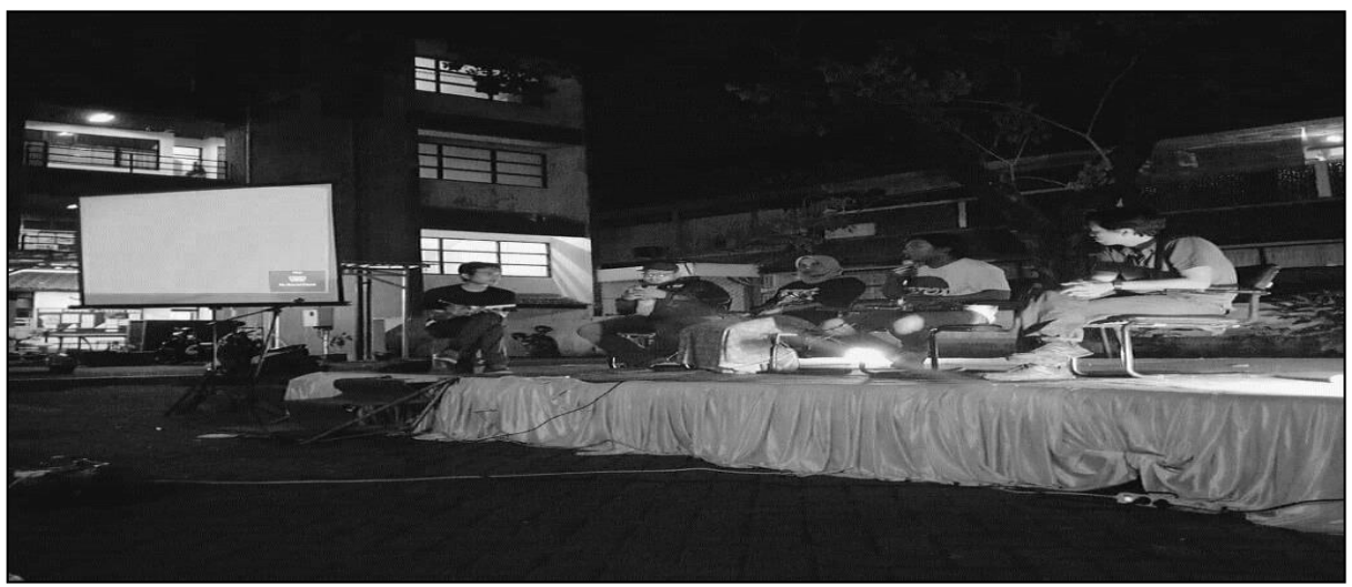
Figure 5. Pendowo Bangkit Campaign in University

Lakardowo Village. Activities to fill out seminars or discussions conducted by Pendowo Bangkit also endeavor to recruit supporters from academia and students who join in their activities to seek justice for the right to a healthy environment. (Figure 5)