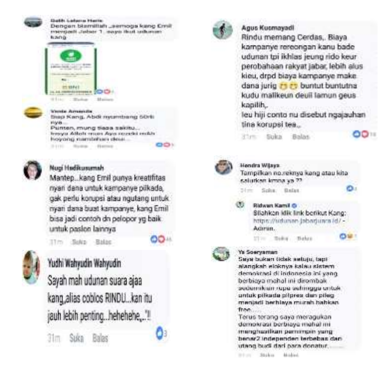
FIGURE 2: COMMENT OF FACEBOOK USER

This is a simple description of the basic structure of netizen discussion related to video crowdfunding on FB Ridwan Kamil