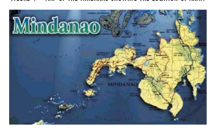
FIGURE 4 - MAP OF THE MINDANAO SHOWING THE LOCATION OF ARMM

The regional government is situated in Cotabato City although the city is not part of the region. There is only one city located in territorial jurisdiction of the region and this is the City of Marawi. Isabela City, which is the capital city of Basilan, is also not part of the ARMM area.