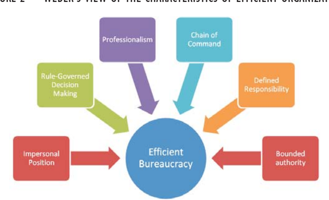
FIGURE 2 — WEBER'S VIEW OF THE CHARACTERISTICS OF EFFICIENT ORGANIZATION

become increasingly relevant. In recent years, modern organizational theories emphasize the need for organizations to be responsive to the needs and demands of the society where they operate. In specific terms, the New Public Administration (NPA) emerged as a result of the inadequacy of traditional paradigms to explain and answer the world phenomena. In addition to the 3Es, the NPA advocates for 3Rs which include: relevance, responsiveness and responsibility. Among the 3Rs, the paper puts emphasis on responsiveness in addition to the 3Es. What then is responsiveness? Responsiveness, in lexical term, refers to "the quality of being responsive, reacting quickly; as a quality of people, it involves responding with emotion to people an d events" (Wikipedia Free Dictionary). In general, responsivess can be better assessed using client satisfaction survey and quasi-experimental study that reflects before and after situation.