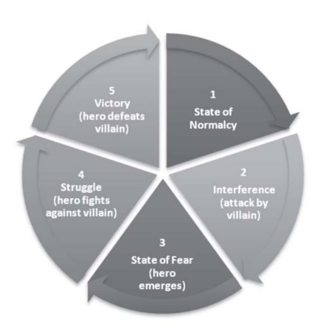
Figure 2. Heroic Narrative Structure

In heroic narratives, the attack by the villain on the victim is not connected to previous events; it is consequential of the disposition of the villain (enemy). In other words, actions by the villain deemed as malevolent do not have a cause, evil is in the enemy's (villains) DNA. The positive virtues and traits embodied by the hero are the opposite of those attributed to the villain (Hogan, 2009). The villains "actions are immoral in themselves, and symptomatic of an underlying immorality of character" (Hogan, 2009: 182). The actions taken by the national in-group are understood to be rational responses to danger, while the actions carried out by the enemies of the national in-group are seen as being intrinsic to their nature. It is perfectly legitimate in heroic narrative to blame the villain for anything. All evil flows from one source-the villain. Of course, true heroes and villains are uncommon in war. It is rarely the case that one side of a conflict has a monopoly on either good or evil. Both sides are capable of displaying altruism and compassion. Similarly, both sides are capable of committing atrocities and engaging in cruelty (Hogan, 2009). Hogan points out that "it may be the case that one side has more justice in its cause than the other, that one side perpetrates more terror than the other-primarily because one side has more power" (Hogan, 2009: 219).