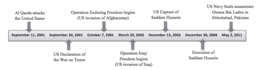
FIGURE 4. KEY EVENTS FOLLOWING 9/11

to rescue them from their oppressors: the Taliban and Saddam Hussein. The brutality of these regimes was reported and emphasized over and over again. For example, abolishing the Taliban's tyrannical patriarchal system was the most powerful justification put forth. After all, who would defend the Taliban's brutal subjugation of women? The population was again presented with a false choice of either allowing the Taliban to oppress its population or supporting the U.S. military occupation of the country. Similarly, the brutal crimes of Saddam Hussein were highlighted. Of course, important details of U.S. complicity in the use of chemical and biological weapons, which Saddam had used against Iran and the Kurdish population in northern Iraq, for example, were not mentioned.