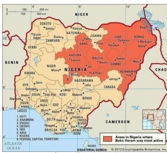
FIGURE 2. THE PLACE WHERE BOKO HARAM MOST ACTIVE

on November 2020, Boko Haram massacred at least 43 villagers near koshobe village in the state of Borno, The victims were butchered with knives and machetes and many of them were missing and between January and November 2020 and in this year there were 142 attacks reportedly linked to Boko Haram, Out of the 142 attacks,17 had no casualties and overall 1,606 people were Killedin the year 2020 (OCHA, 2020).