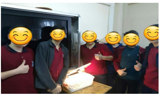
Figure 4 3rd group that created their prototypes

Steps 7-8. Communicate the solution and redesign: Implementing engineers share their ideas, solutions, and designs with others for feedback and marketing purposes (Hynes et al., 2011). As engineers do, students can communicate their solutions through presentations, written documents, or other tools. In this process, students must indicate their design presentations' conditions, performances, problems, limitations, and criteria. In doing so, students will make an oral presentation using a language understandable to the target audience.