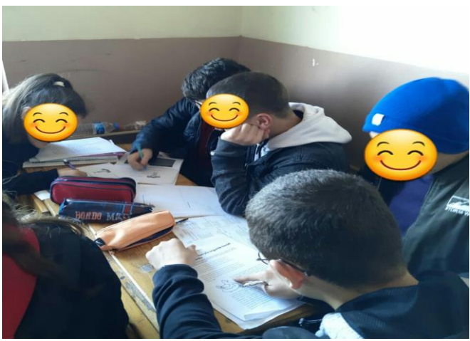
Figure 3 Group work on selecting the best possible solution

Step 5. Construct a prototype: A prototype is a model (physical, virtual or mathematical) that represents the final solution (Hynes et al., 2011; Karslı-Baydere et al., 2019; NRC, 2012). The most important feature of this state is