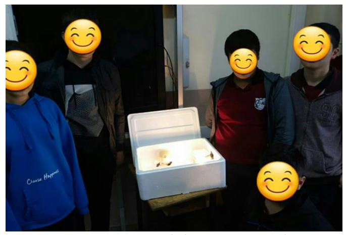
Figure 5 Group 6 presents their prototype to other groups

Steps 7-8. Communicate the solution and redesign: Implementing engineers share their ideas, solutions, and designs with others for feedback and marketing purposes (Hynes et al., 2011). As engineers do, students can communicate their solutions through presentations, written documents, or other tools. In this process, students must indicate their design presentations' conditions, performances, problems, limitations, and criteria. In doing so, students will make an oral presentation using a language understandable to the target audience.