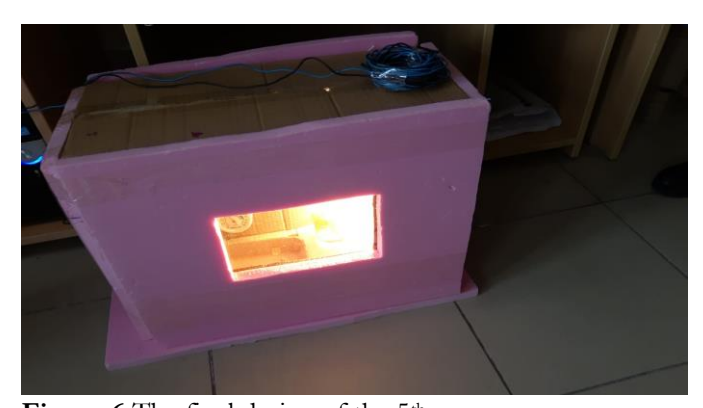
Figure 6 The final design of the 5th group

Step 9. Completion: In this step, students decide that they adequately meet the design requirements and are ready to implement their prototype as a final product (See Figure 6). In this step, after the students have decided that their prototype is ready to implement as a final product, the teacher asks them to introduce their designs by giving instructions, "prepare a product introduction or user manual to popularize your design". The aim here is to realize the importance of marketing a developed product and developing a product.