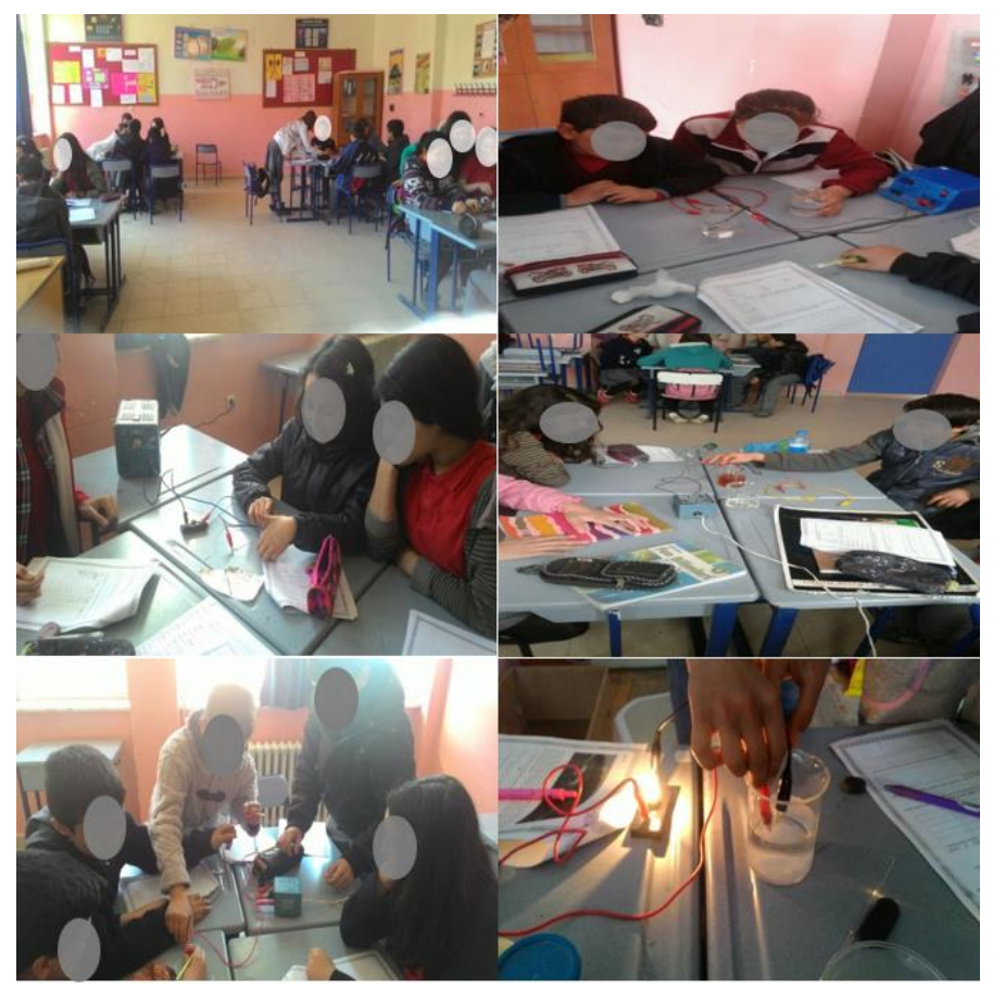
Figure 4 Some photos of students during experimental studies

this group included activity exercises in official textbooks, smartboard exercises, listening to the teacher, and answering questions. Students in this group did an experiment based on the book. They didn't design the experiment themselves. Often observed by the students who made teacher experiment in demonstration experiments.