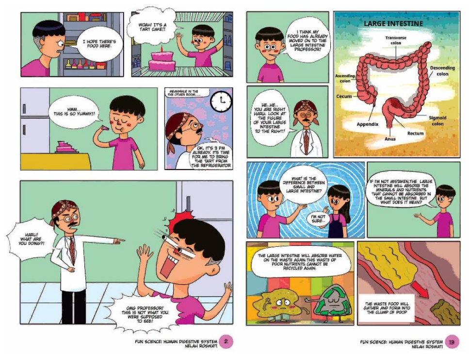
Figure 1 The example of two pages of the comic book developed in this study

aspect can see in Table 3. In addition to this study, the researcher also added the data of observation in class and the students' interview after implementation. The result data will analyze in the result session.