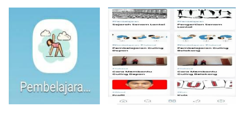
Figure 1. Results of the Development of Front and Back Rolling Mobile Learning Products.

Development of Front and Back Rolling Mobile Learning Products Development products are packaged in the form of mobile learning applications and can be accessed via smartphones. In the application there are several menus, namely, understanding floor exercises, history of floor exercises, KI/KD, front and back roll videos, how to help front and back rolls, author bio and quizzes. Initial view of the application Main Menu Display.