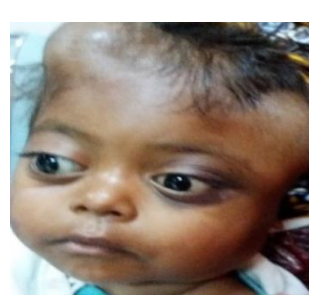
Figure 4: Bony Metastases and right proptosis at presentation.