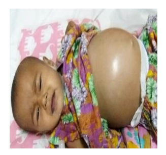
Figure 3: Infantile neuroblastoma