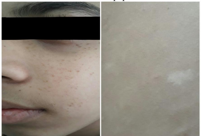
Figure 1: (A) Facial angiofibromas. (B) Hypomelanotic macules of the index case He was admitted with initial suspicion of a space-

A 12-year-old boy was brought by his parents with complaints of headache, vomiting for one and a half months; and two episodes of generalized tonic fits. He was otherwise a developmentally normal child, a product of non-consanguineous marriage with unremarkable history. He had one elder brother who was a known epileptic on anticonvulsant medications with poorly controlled fits. He had one accompanying EEG which showed intermittent delta waves in bilateral parieto-occipital regions. On examination, he was vitally stable with BP within normal centiles. He had nodulopapular rash on his face (facial angiofibromas) and three hypomelanotic spots on his body. The rest of his general physical, systemic, and CNS examination was unremarkable. His fundoscopic examination revealed bilateral papilledema.