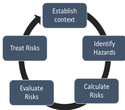
Figure 1 | The risk assessment process.