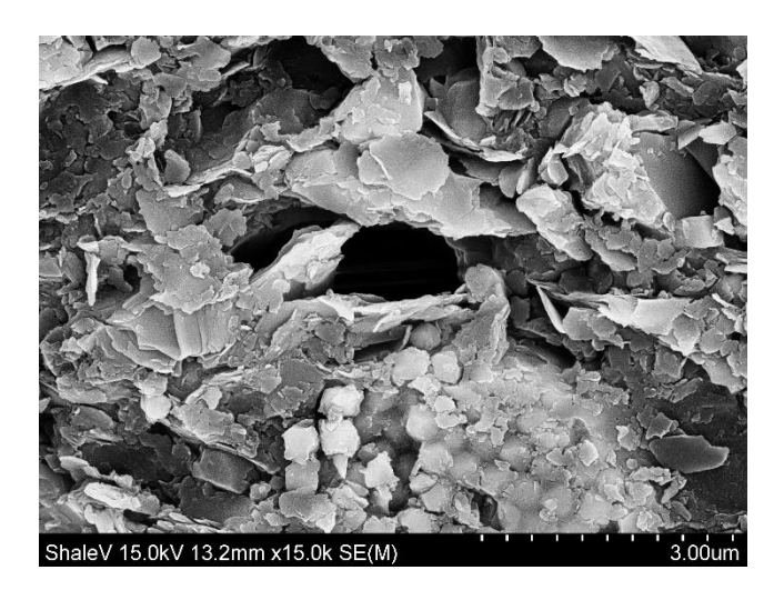
Figure 2. Typical of microstructure of sedimentary rock (shale)

features, intra-granular porosity, anisotropy degree, petrophysical characteristic, mineralogy, thermal history, organic content, location, depth, and so on. of the porous rock and shale are needed [1]. In general, there are no unique parameters for shale.