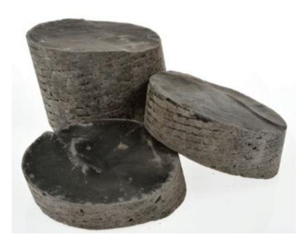
Figure 1: Example of Shale core [2]

features, intra-granular porosity, anisotropy degree, petrophysical characteristic, mineralogy, thermal history, organic content, location, depth, and so on. of the porous rock and shale are needed [1]. In general, there are no unique parameters for shale.