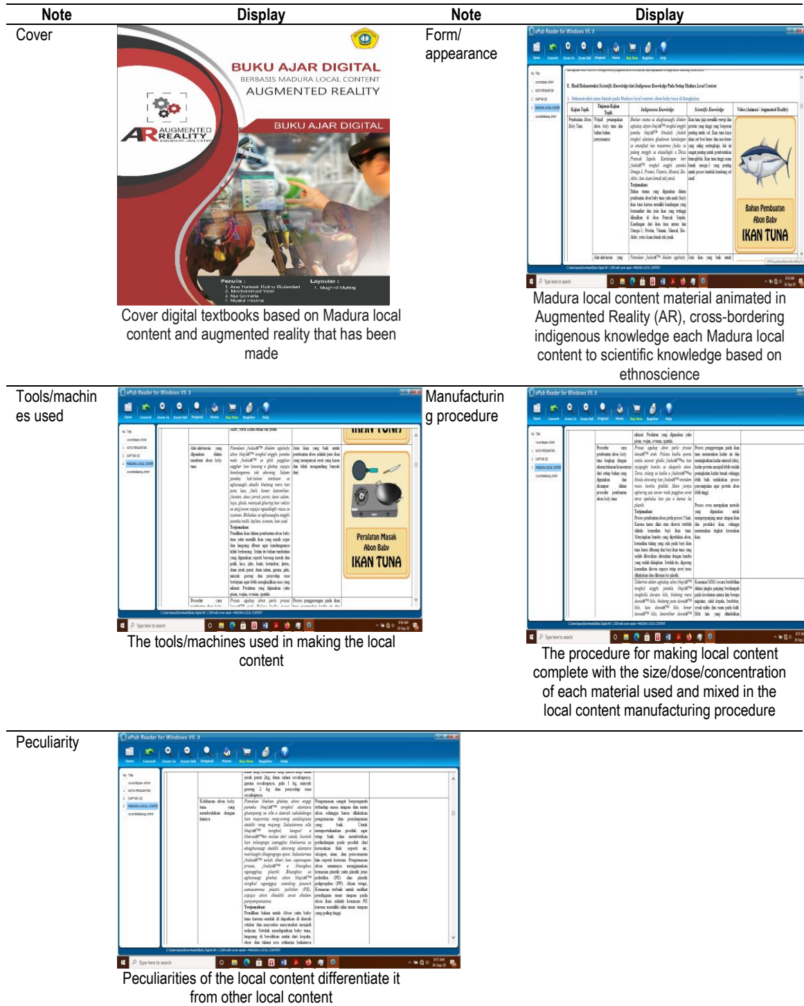
Table 2. Assessment of digital textbook aspects