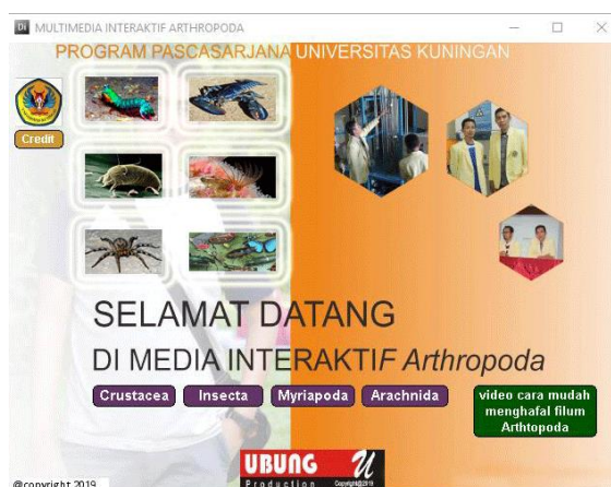
Figure 1. Interactive multimedia interface design based adobe director

The sub-menu of each phylum Arthropod consists of a mind map, instructions, core & basic competence, material summaries, learning & purpose indicators, interactive video menu, test menu, and audio (Figure 2). A prepared video display (Figure 3) has some benefits: full high definition video quality, interactive content, video can stop, when the cursor is pointed at one organ you will see. Organ reference it can be regenerated.