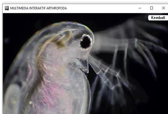
Figure 3. Full high definition video quality that has interactive media