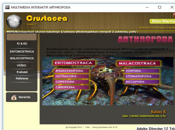
Figure 2. The menu of each of phylum Arthropod