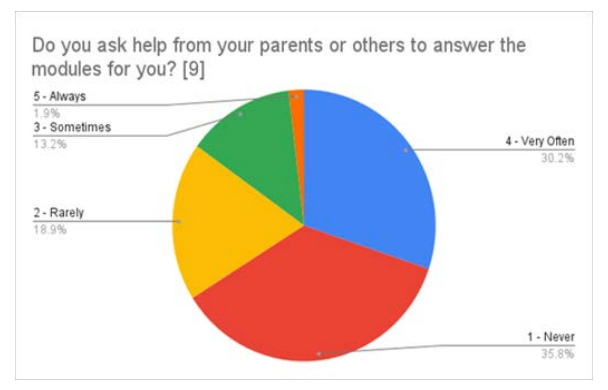
Figure 1. Degree of Independence in Answering Modules

Results show that 30.2% very often, 13.2 % sometimes, 18.9 % rarely, and 1.9% always ask their parents to answer the modules, while 35.8% never ask their parents to answer them.