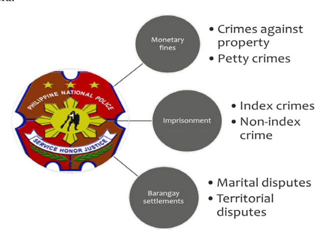
Figure 3. Philosophy of Law Enforcement

The pedagogy of this law is through simply passing on the stories of elders from generation to generation and thorough exposing the child into the culture. However, the bodong provisions are limited only to other people, only the peace pact holders or the bodong leaders have full access on the book of Pagta in Cordillera.