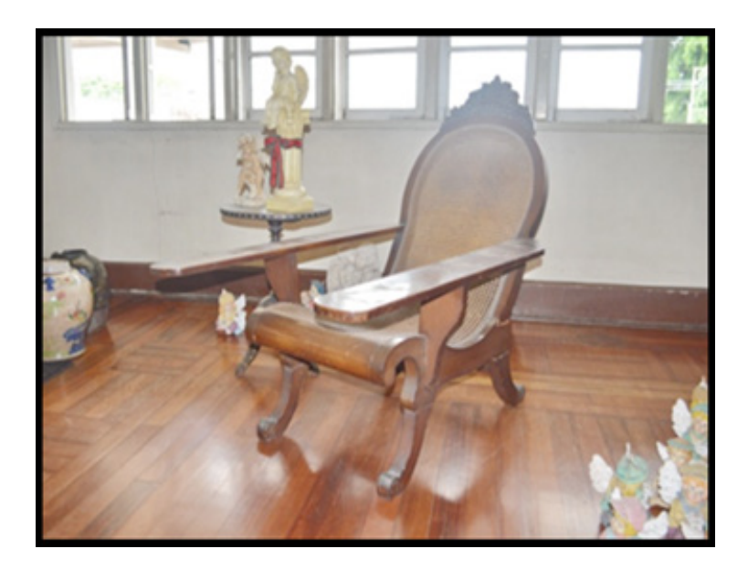
Figure 5. The Butaca/Planter's Chair in Ramos-Dizon Museum

As to the comparison with other specimens, planter's lounging chair in Bernardino/Ysabel Jalandoni Museum could be best compared to the planter's chair in Ramos-Dizon Museum.