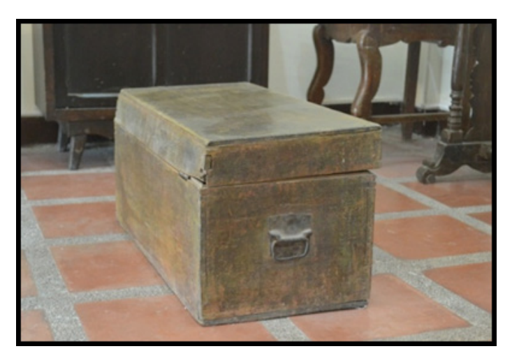
Figure 3. The trunk in the USLS-B Museum

Wooden camphor trunks were a part of Chinese culture as early as the 18th century. When Chinese people started to trade, they also brought with them their practice. Thus, they used to store everything from blankets, clothes and linen to food and personal papers. When they reached the shores of the Philippines, they also brought with them the camphor trunks.