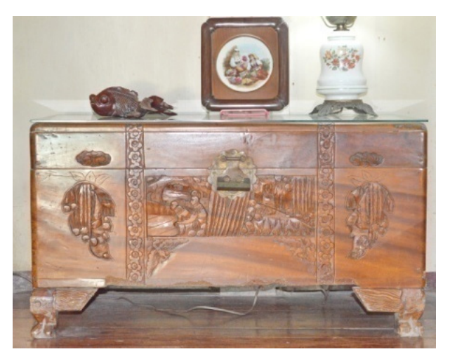
Figure 1. The Camphor Trunk in Manuel Severino Hofileña Heritage House