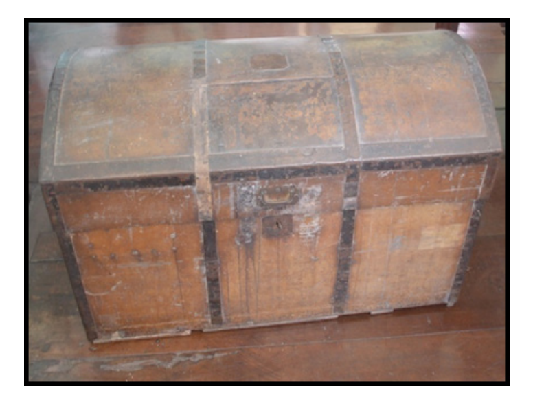
Figure 2. The trunk in Bernardino-Ysabel Jalandoni Museum

Through the examination of the camphor trunk, the researchers found out that there are no significant changes in the general forms, construction and popularity of the items since the 18th century. However, the decoration and iconography have a considerable difference.