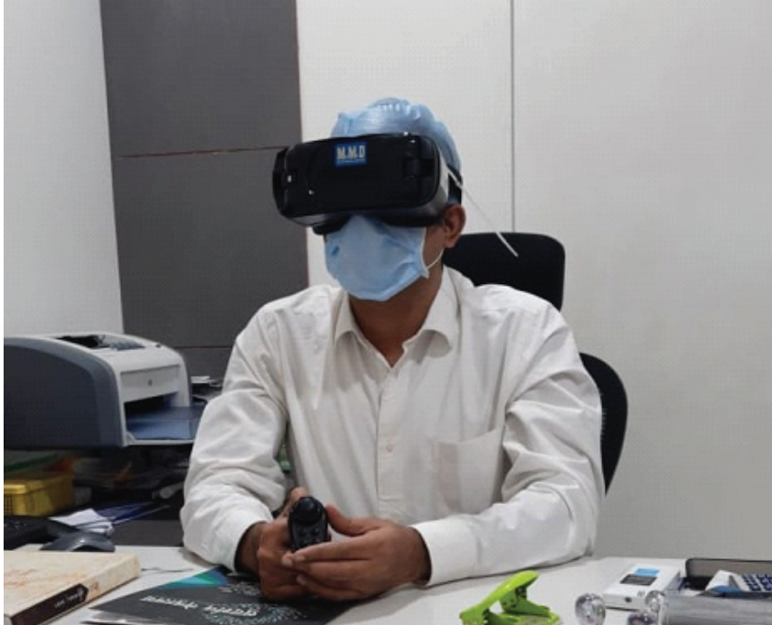
Figure 1. Figure showing the use of the instrument in a participant.

for this analysis. The following analyses were done: (1) comparison of glaucomatous versus non-glaucomatous eyes and (2) severity of glaucoma (mild/moderate/severe) in eyes that were classified as glaucomatous.