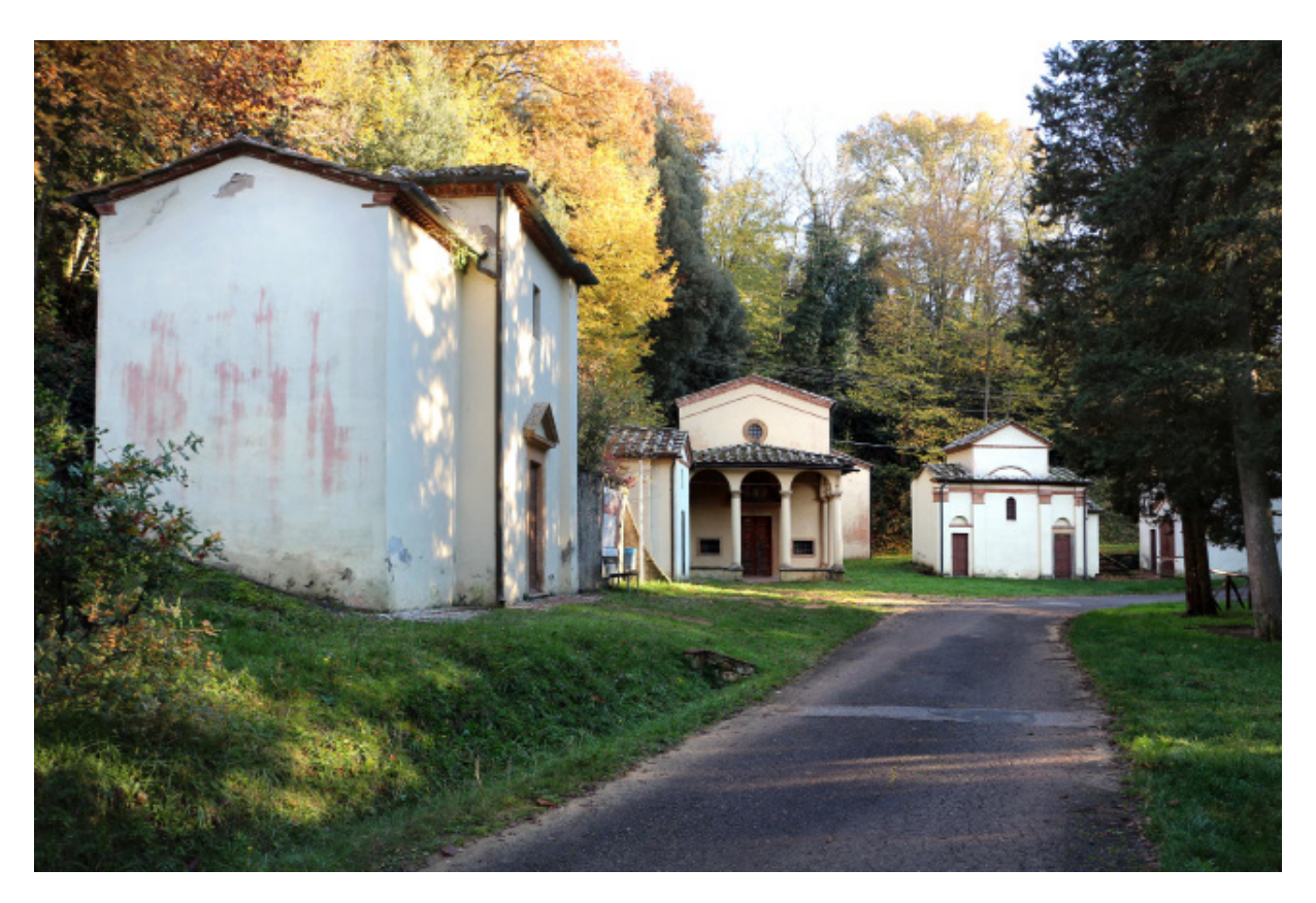
Figure 3 To the left the Chapel of Pie Donne, in the middle Oratory of the Madonna dello Spasimo ( Fainting Madonna ). Far right Capella dell'andante al Calvario ( For the pedestrian to Mount Calvary ). San Vivaldo .