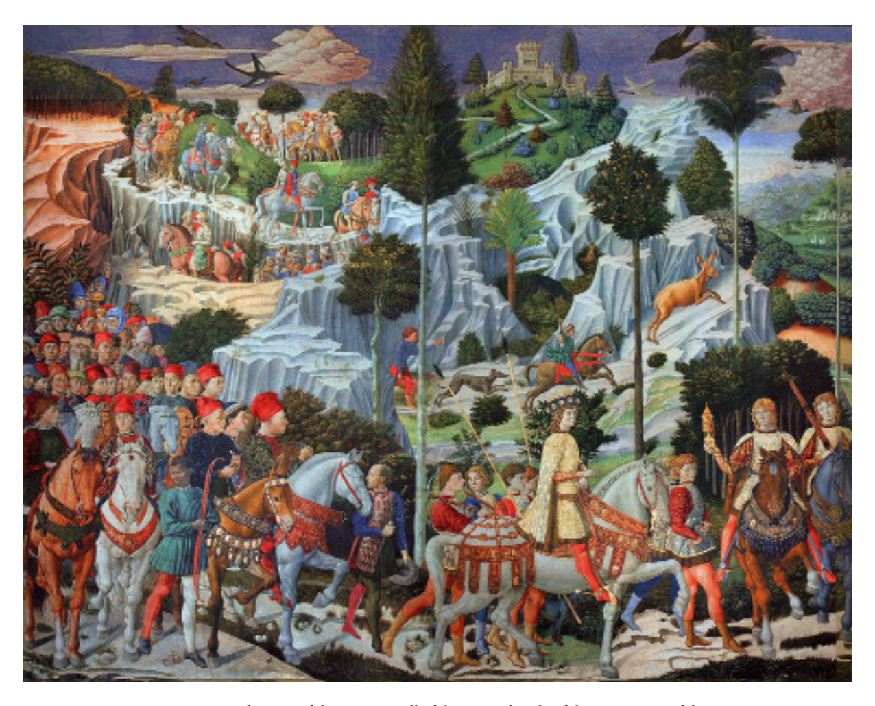
Figure 1 Benozzo Gozzoli. View of the eastern wall of the painted cycle of the Procession of the Magi. 1459. Mixed media. Chapel of the Magi, Palazzo Medici Riccardi, Florence.

The unity of the artistic decoration in the chapel has emerged first and foremost because it was designed in every detail with the somaesthetic experience of visitors in mind (AT, 57-58). The visitors, who came mostly from the upper classes, are key players in the sensory and embodied experience of the artistic interpretation of the Magi procession and the other elements of the decoration of the chapel. The sumptuous floor tiles function as standing markers for the visitors and guide their movements through the chapel's space. They are encouraged to walk the same path as the Medici. Allie Terry-Fritsch's unveiling of the coordination of the serpentine composition of the wall paintings with the movement of the viewers, which actually inspired them to follow the very powerful procession in fictional reality, is an original observation. This observation stands in contrast to many interpretations of the "Renaissance spectator, who is given spectral dominance over a spatial continuum from a fixed position" (AT, 94).