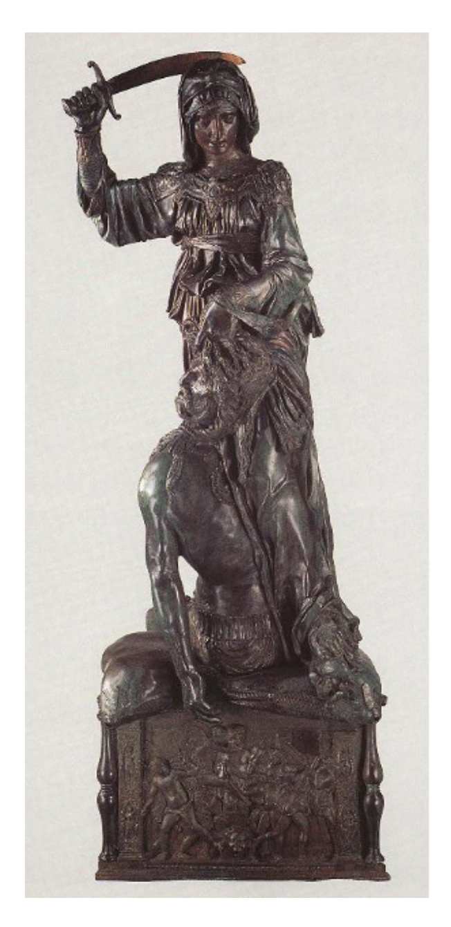
Figure 2 Donatello. Judith and Holofernes. 1464. Bronze. Located between mid 1460 and 1495 in the garden of Palazzo Medici, today in the Sala dei Gigli, Palazzo Vecchio, Florence.

in the garden of the Palazzo Medici where it activated the audience and revealed new aspects of Donatello's statue, which could be seen from several angles and therefore revealed different sides of the new interpretation.